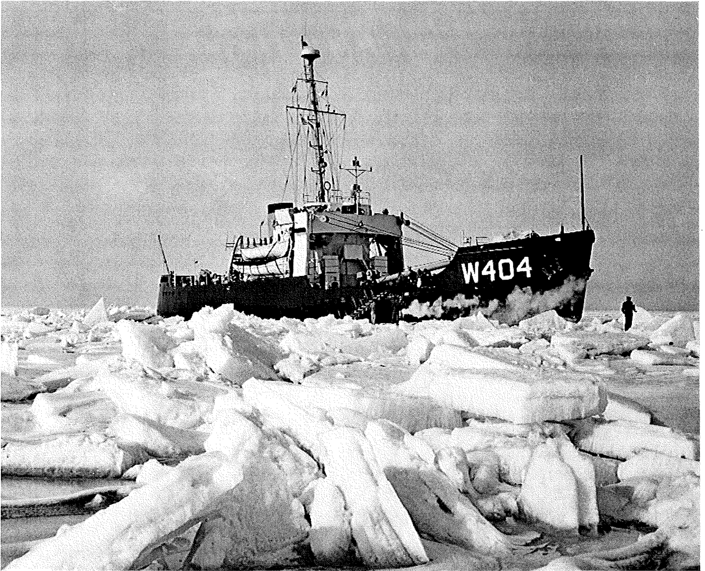
Figure 10 SUNDEW pushes through thick ice.