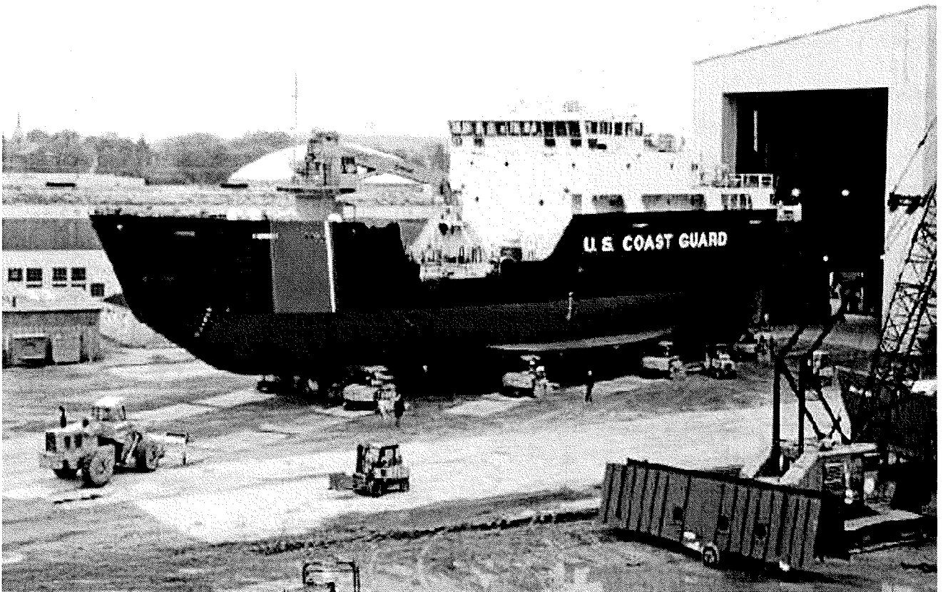
Figure 12 A new Juniper class buoy tender nears completion at the Marinette Shipbuilding Yard.