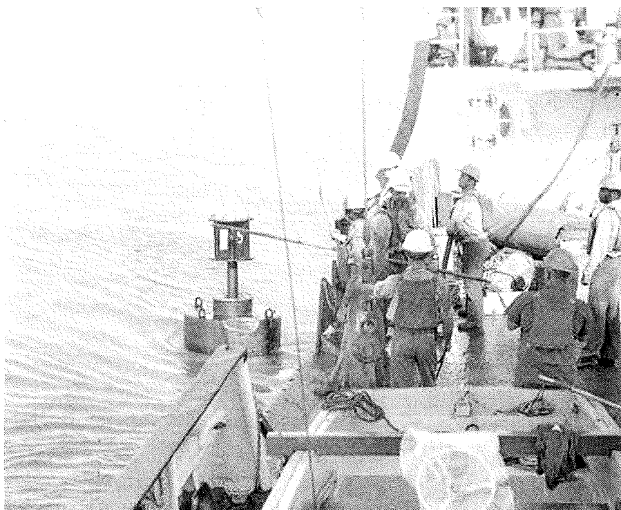
Figure 7 The deck crew aboard BLACKHAW prepares to service a navigational buoy.