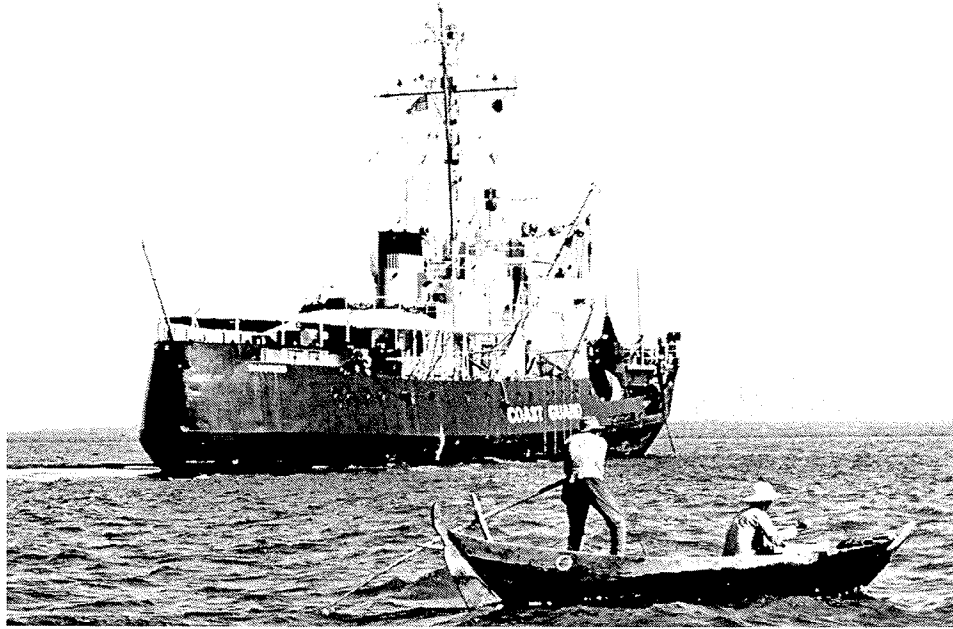
Figure 8 BASSWOOD in Southeast Asian waters.