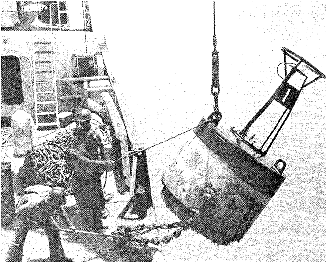
Figure 5 Crew of a buoy tender hauls aboard a navigational buoy off the coast of South Vietnam.