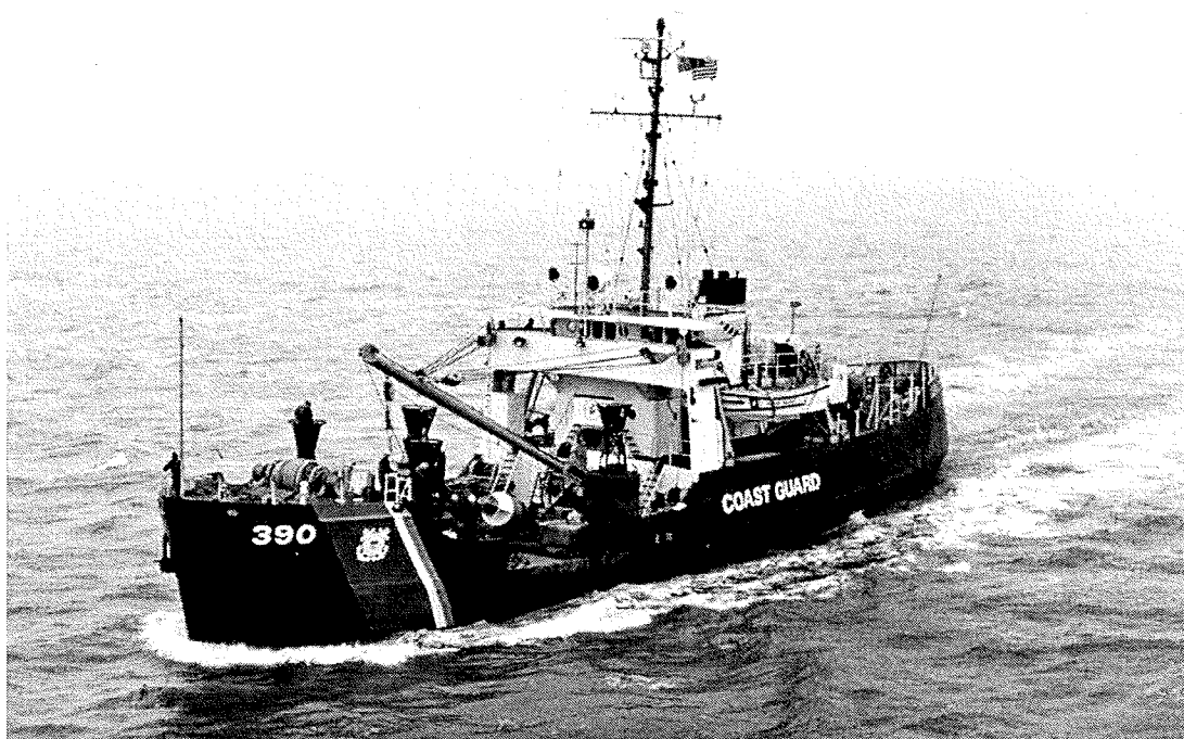
Figure 6 BLACKHAW underway off the coast of South Vietnam.