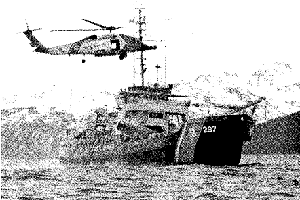
Figure 9 IRONWOOD works with a USCG helicopter off the coast of Alaska.