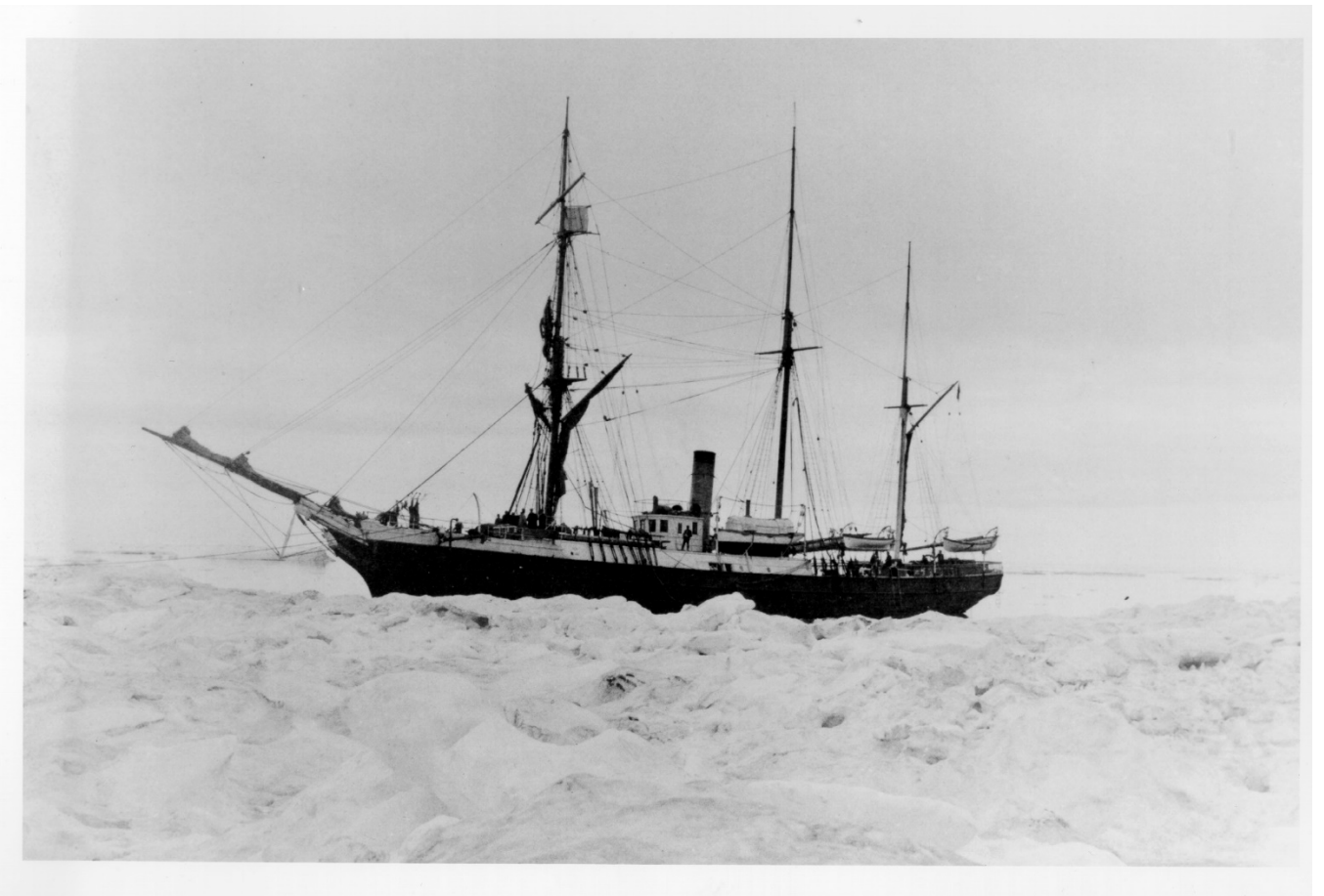
No caption/date/photo number; photographer unknown