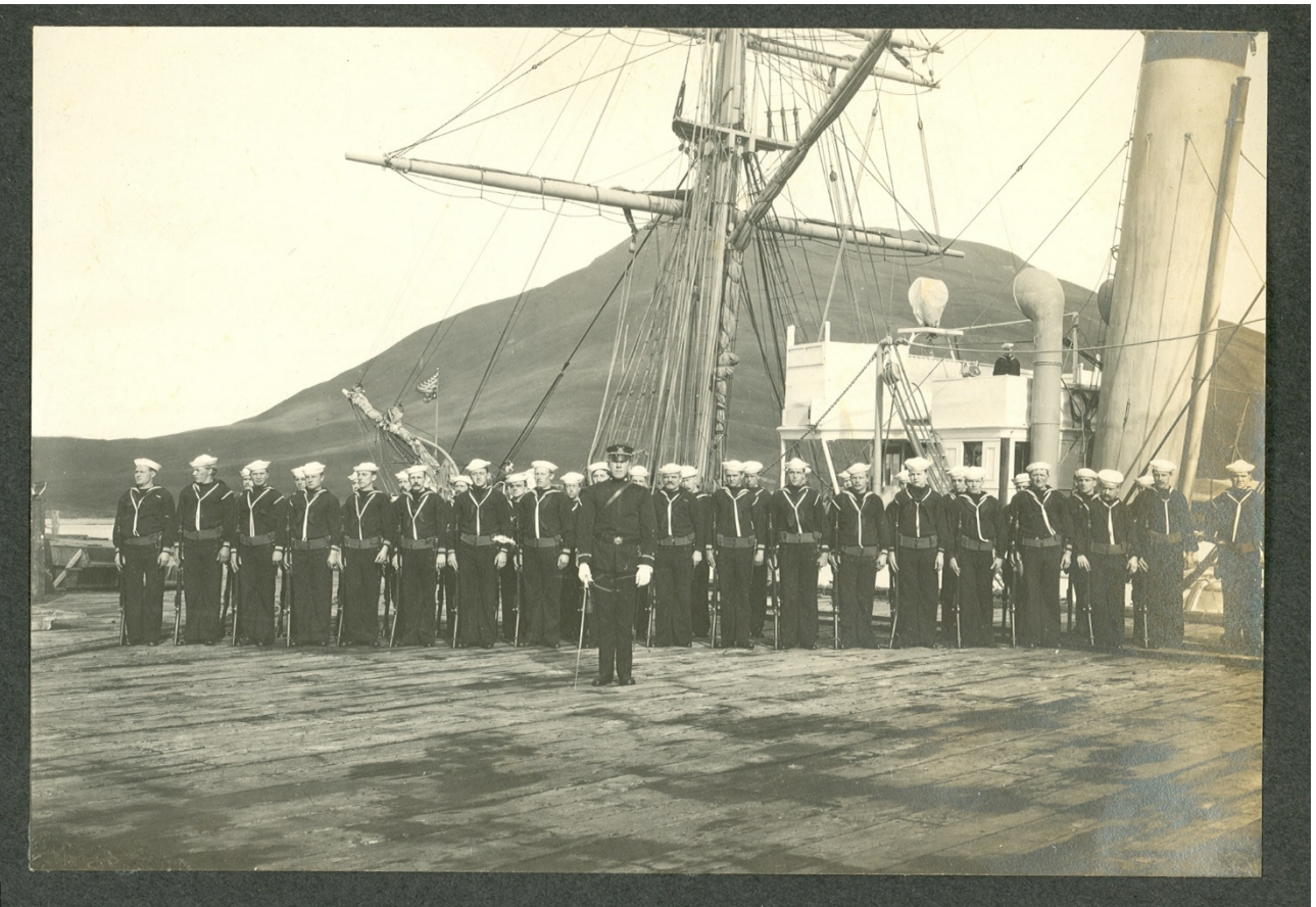
No caption, date or photo number. Crew of Bear practice infantry drill.