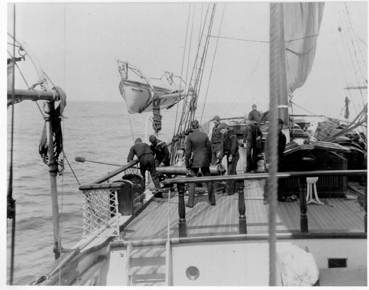
No caption; summer, 1895; no photo number; photo from scrapbook of John M. Justice.