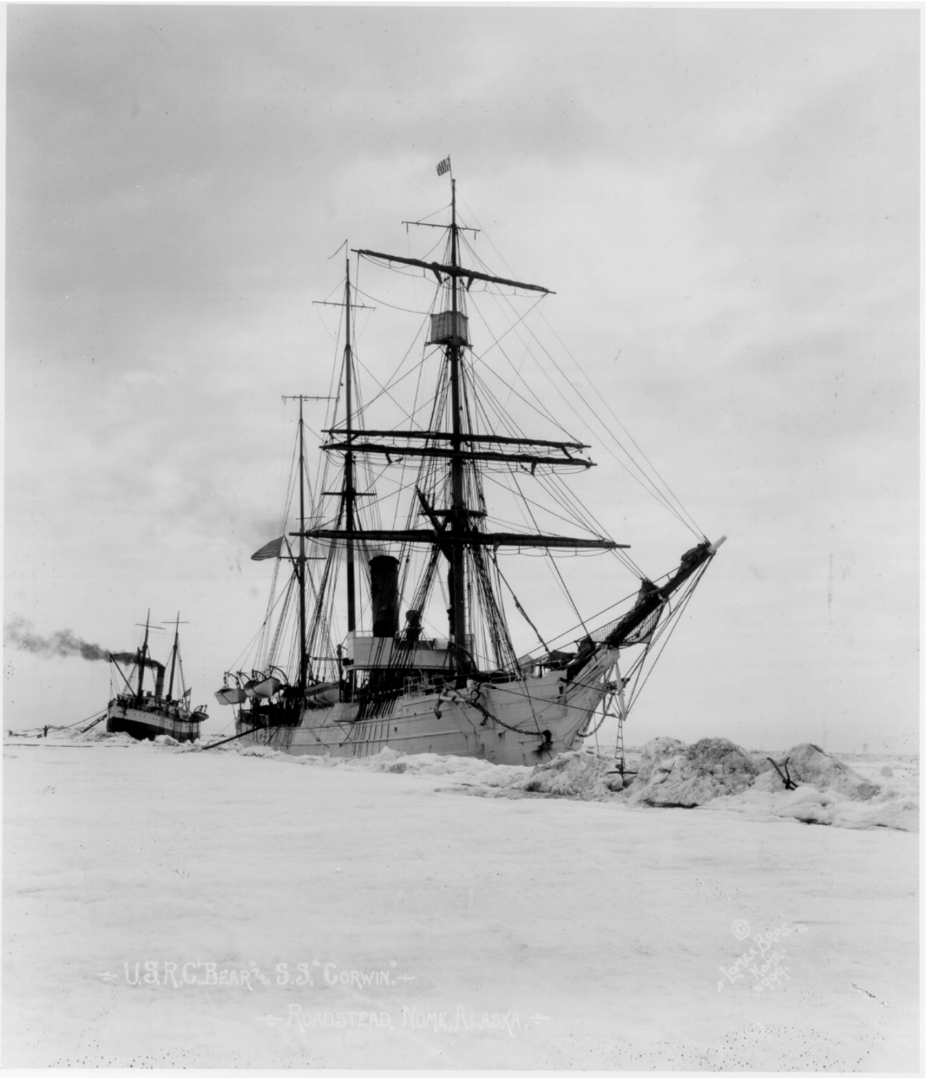
"U.S.R.C. 'Bear' and S.S. 'Corwin' -- Roadstead, Nome, Alaska." No date/photo number; photo by Lomek Bros., Nome.