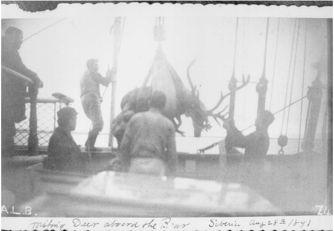
"Hoisting Deer aboard the Bear, Siberia, Aug 28th 1891."; no photo number; photographer unknown.