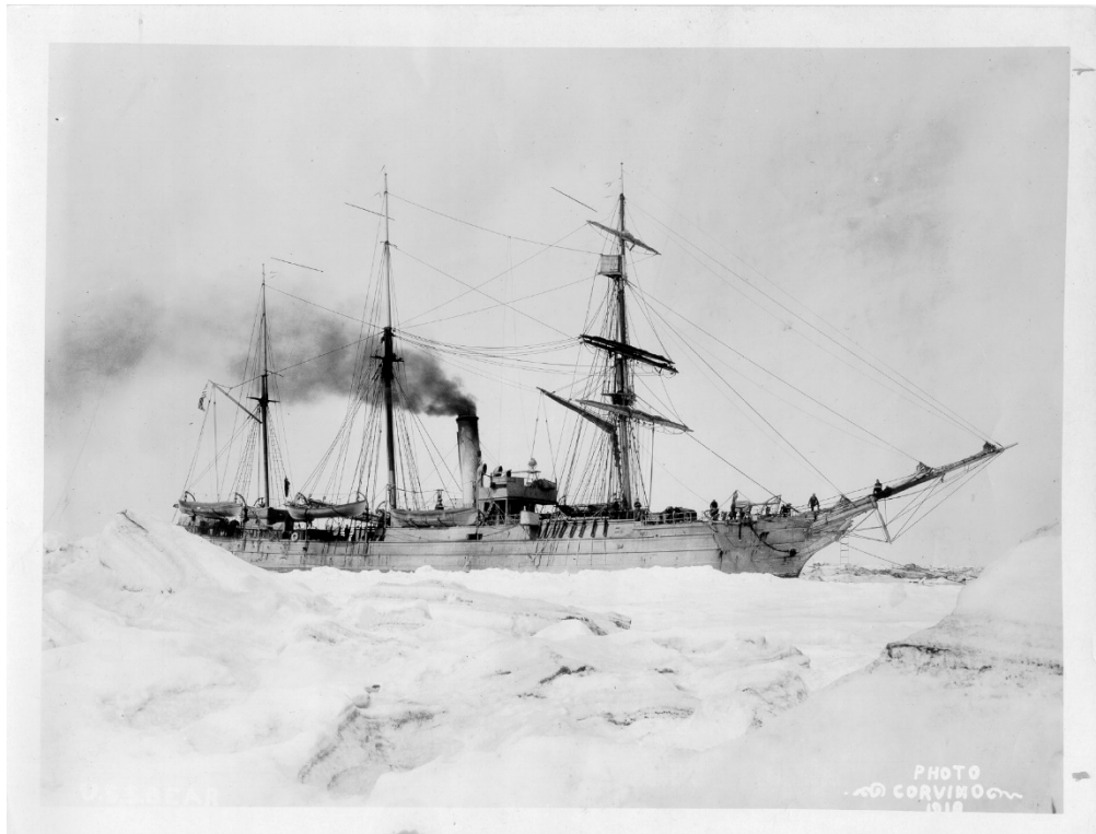
No caption/photo number; 1910(?)