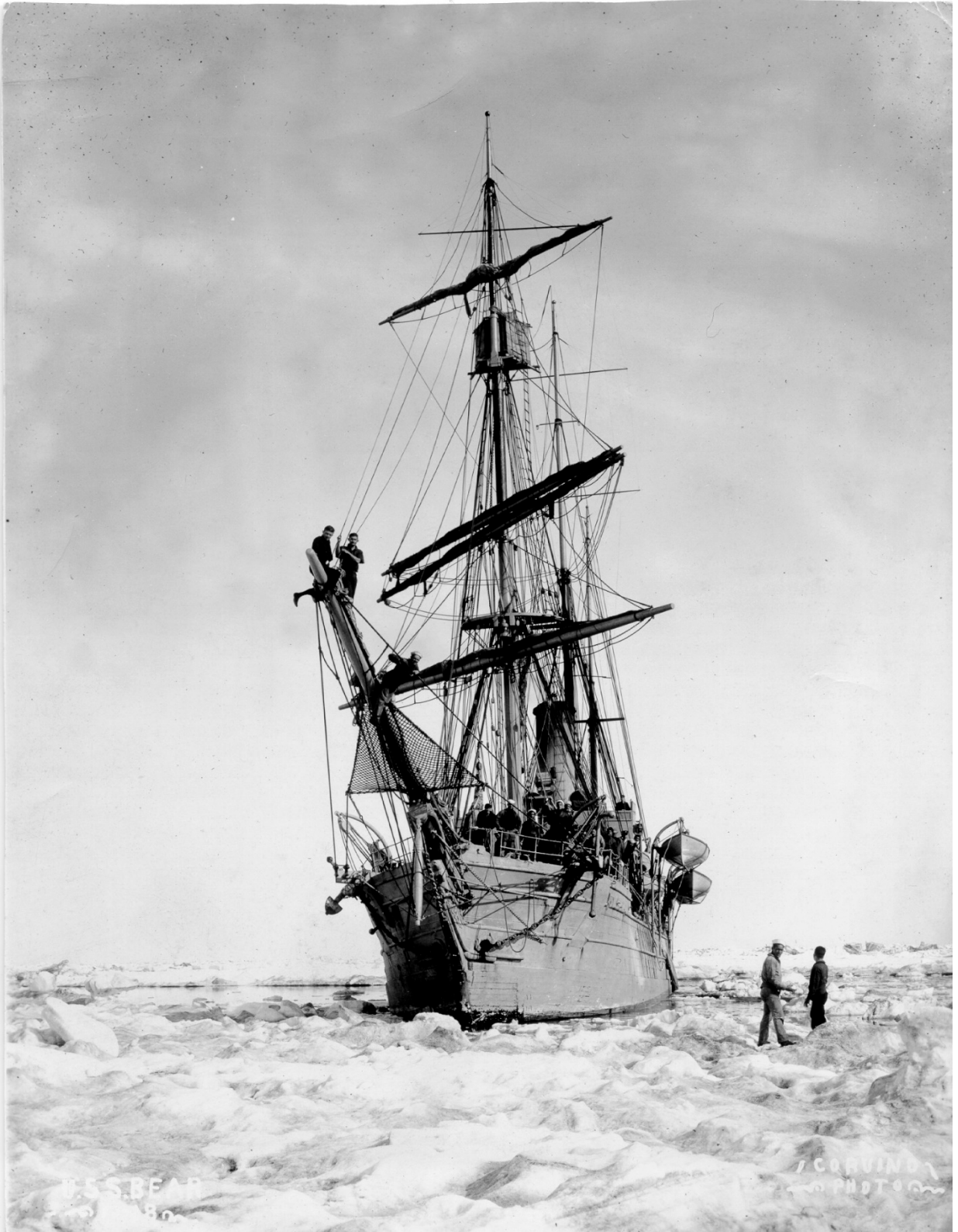
No caption/date/photo number; photographer unknown.