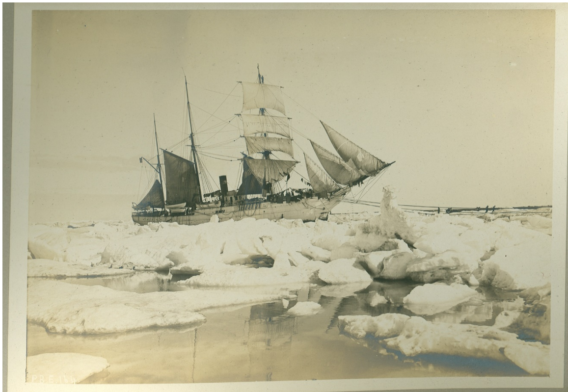
No caption, date or photo number. Photographer unknown.