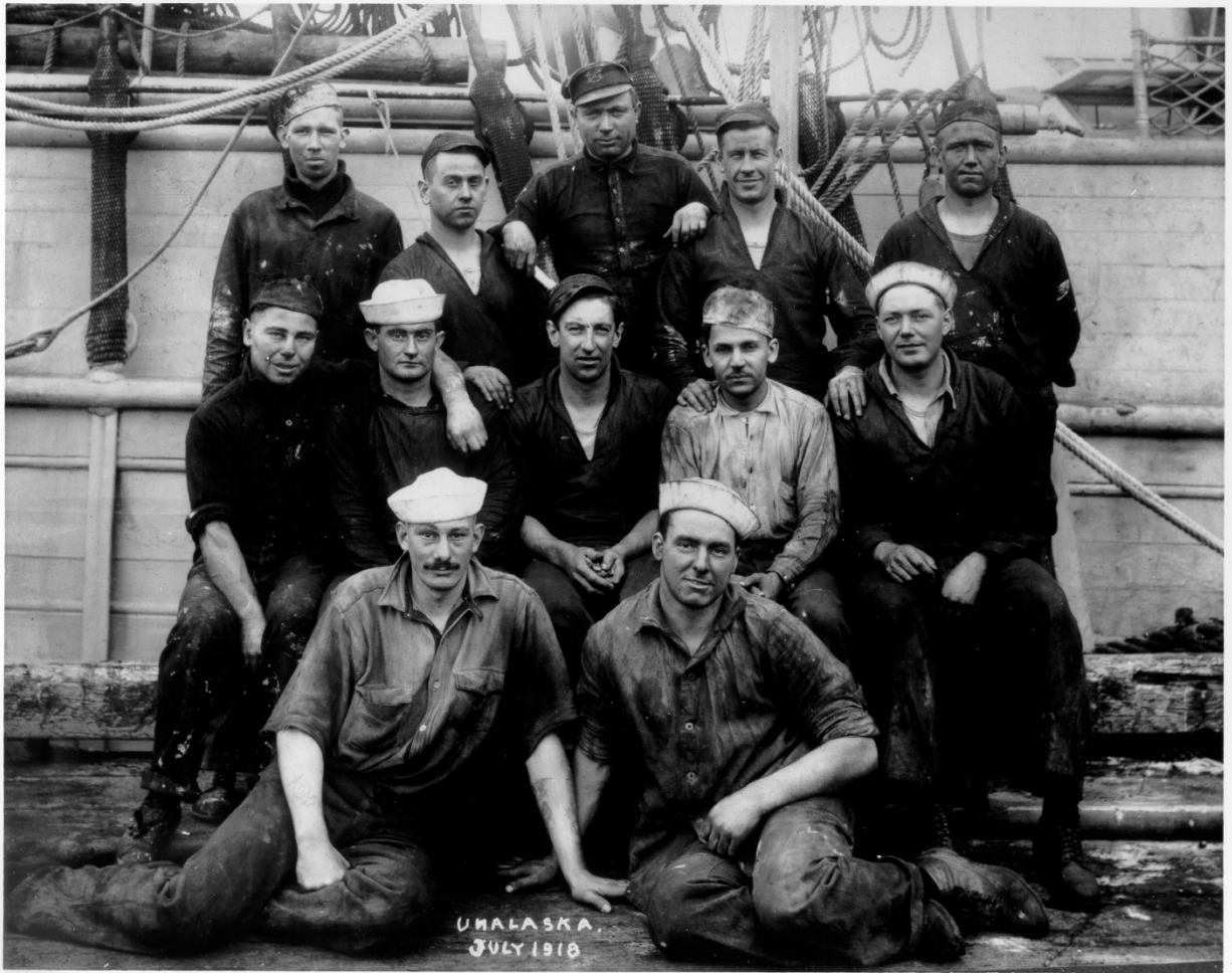
"Unalaska, July 1918." No photo number; photographer unknown. Crewmembers after coaling Bear .