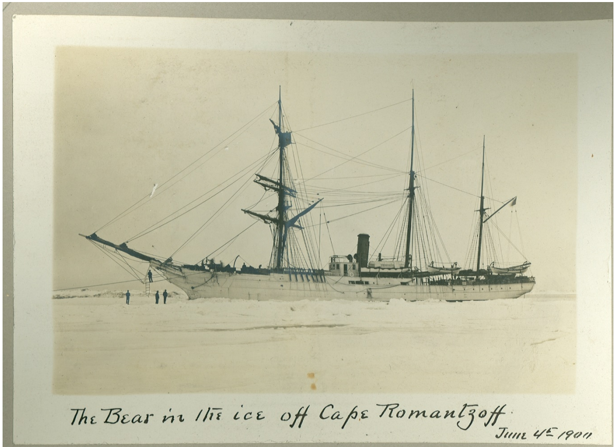
"The Bear in the ice off Cape Romantzoff, June 4 th , 1900."