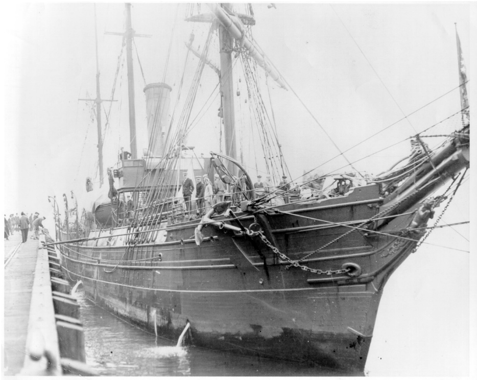
No caption/date/photo number; photographer unknown.