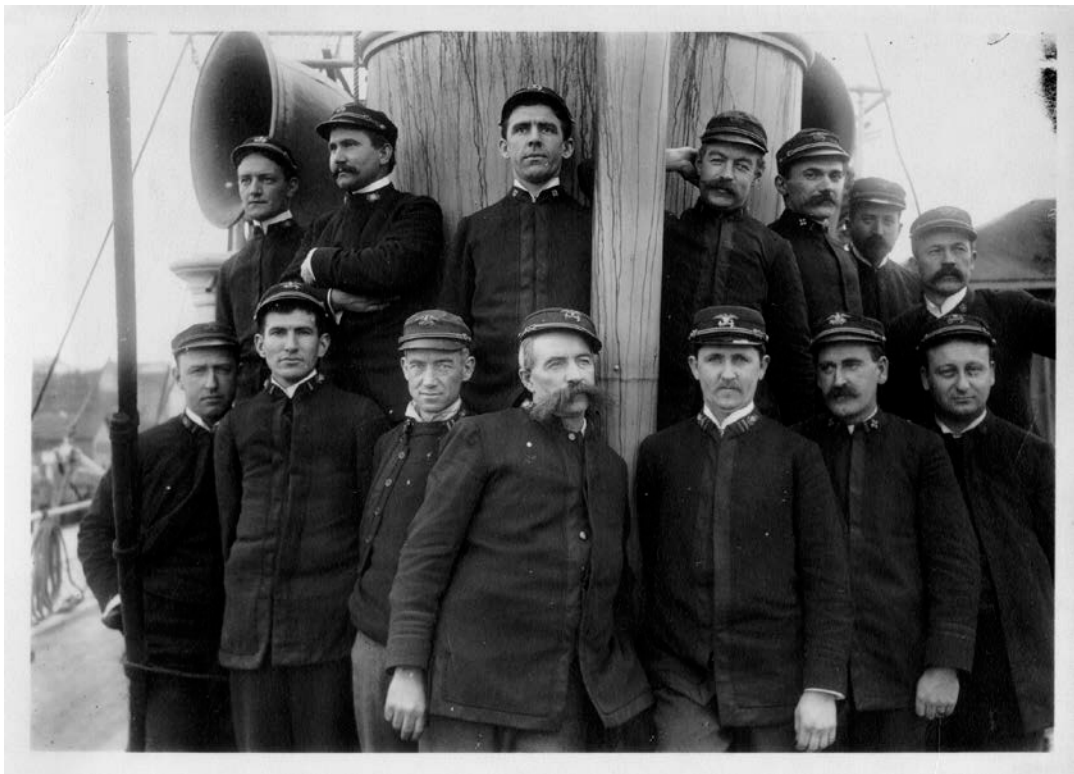
No caption; Summer, 1895; no photo number; photo from scrapbook of John M. Justice.