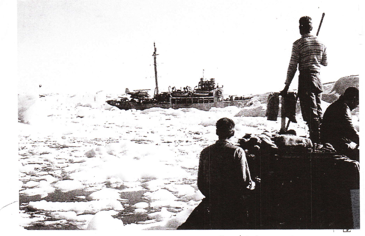
USCGC NORTHLAND'S RESCUE of 8-planes "Lost Squadron" on July 23, 1942, before USAAF WEATHER-RESCUE STATION, BEACH HEAD STATION, built at Comanche Bay in August 1942.