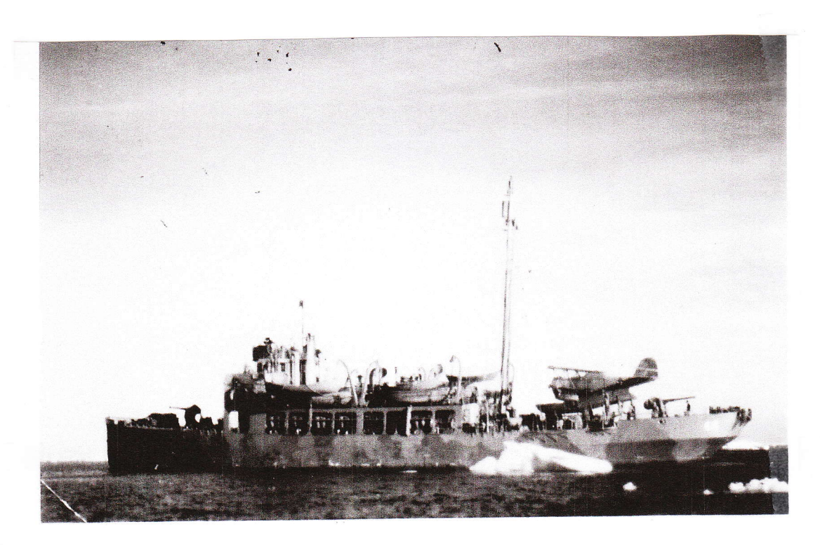
USCGC NORTHLAND with its Grumman J2F-4 Duck, Summer 1942