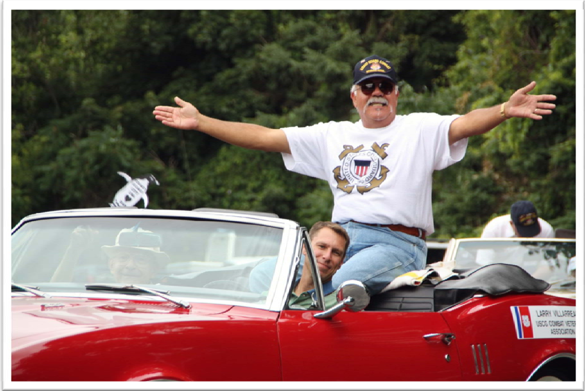
Coast Guard Day honoree.