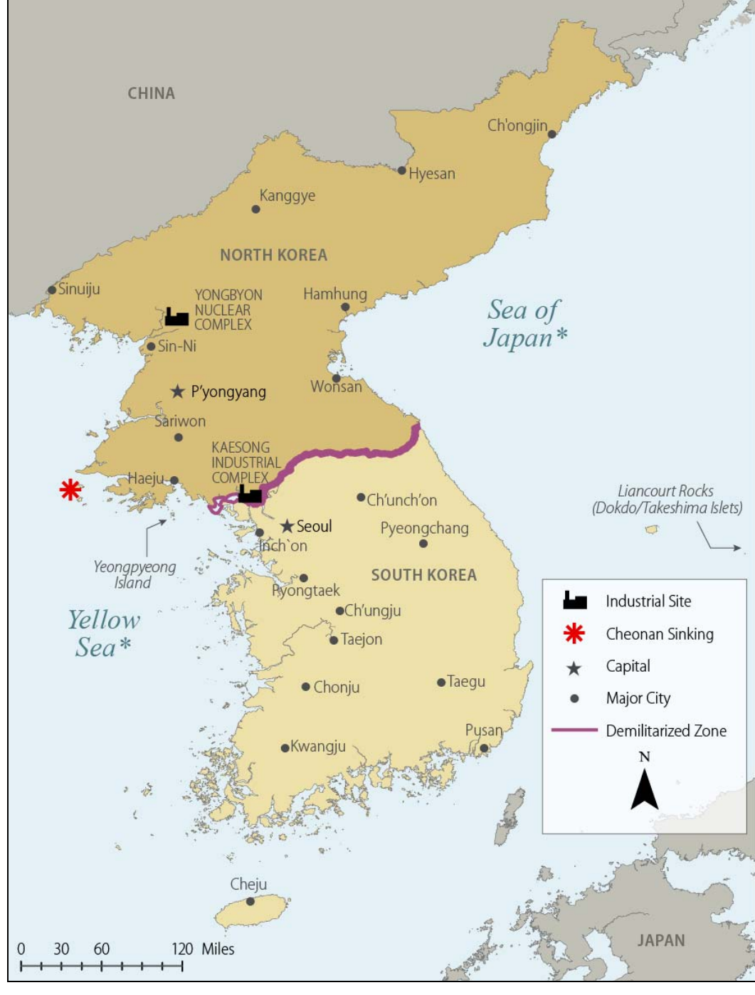
Figure 1. Map of the Korean Peninsula

Sources: Map produced by CRS using data from ESRI, and the U.S. Department of State's Office of the Geographer.