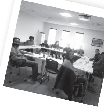
Orientation at UA.

Of these new individual volunteer inquiries, 123 are currently serving (13 are UAServe Champions), 50 were matched but have not yet served, and 56 remain interested in serving but have not yet been matched.