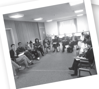
On-site orientation at Chinese Baptist Church in West Hartford.

Many volunteers from these orientations continually serve at Bible Way Temple Nation.