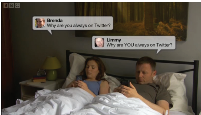
Fig. 9 Functionalist typography of Twitter as cultural aesthetic. Limmy Show television program written and directed by Brian Limond for BBC Television, UK January 2010.

These graphematic symbols and organisational structuring associated with computational communication do not just perform certain technological functions then. Nor are they simply a visual shorthand for computation. Instead they have been co-opted and disseminated to become social and cultural signifiers in their own right.