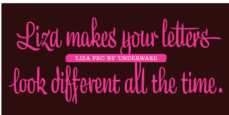
Fig. 3 Liza Pro designed by Bas Jacobs, Akiem Helmling and Sami Kortemäki

Paraphrasing the artist Eric Gill, 5 type designer Erik van Blokland has neatly captured this shift in mediums: 'Letters are programs, not results of programs' (Fraterdeus 1997, 130). Indeed, beyond the specialism of type design