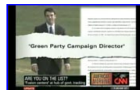
Are you on the list? CNN Explores Fusion Centers