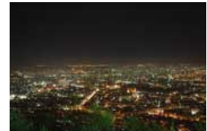
Dispatches from Damascus: Check out reporting from Damascus, Syria and the Iraqi border.