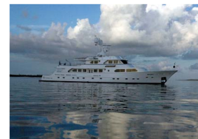
UPWIND: Halfway Around the World on Maverick II