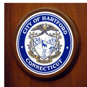
Hartford: Life in The 'Beat