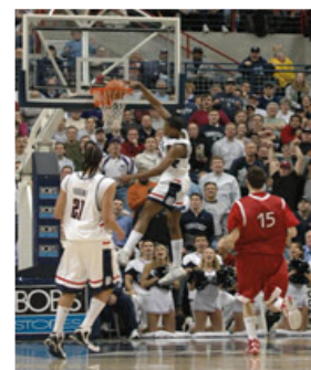
NCAA Sports: Amateur Students or Pro Athletes