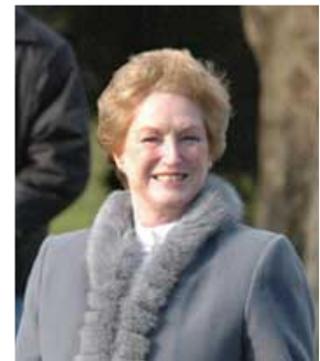
The Gov. M. Jodi Rell Inaugural Caption Contest & Photo Essay