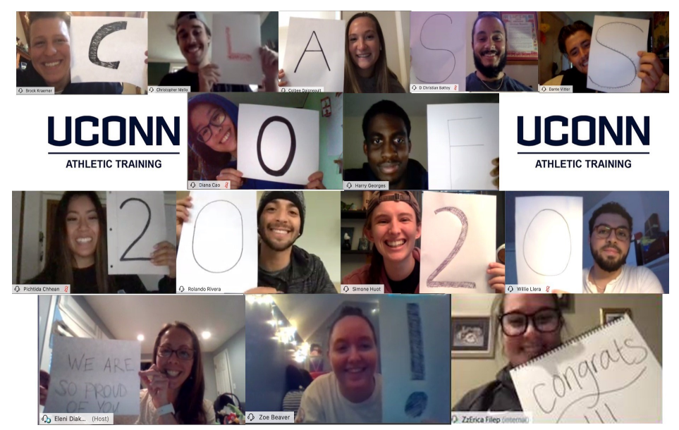
The class of 2020 during one of their final classes in the Spring 2020 Semester