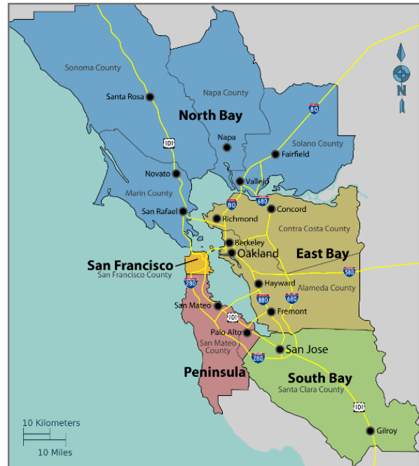
Figure 1: Bay Area Map

Ranging from Michelin star restaurants to food trucks, with gastronomical ingenuities on display from cultures all over the world, the Bay Area offers the culinary tastes and adventures for everyone. Accompanying the cuisine are wineries, old and newer, with higher concentrations in the famous Napa Valley area just north of SF. A rising brewing scene continues to expand on their ingredients, flavors and the brewing spaces. The large Asian and Latino populations offer some of the more 'authentic' and delicious options in the area. There are endless great options and cultures with styles for everyone.