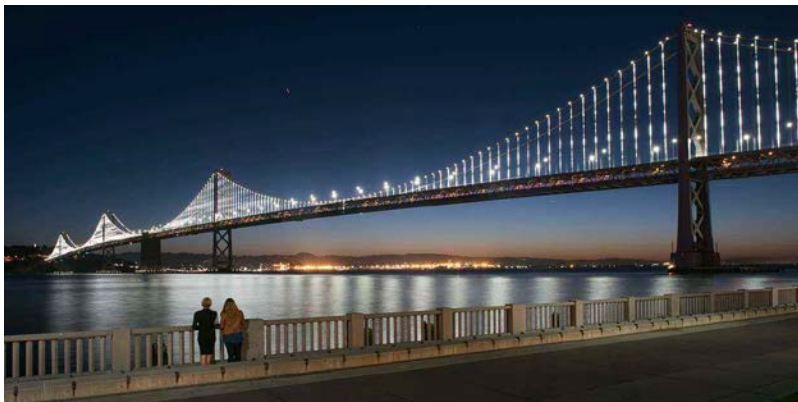
Figure 2: SF-Oakland Bay Bridge

Many bridges help keep Bay Areans connected, with the most iconic being the Golden Gate Bridge, which connects San Francisco to the North Bay. The Bay Bridge, which is older than the Golden Gate by 6 months, links Oakland and San Francisco together. While compatible for cars and bikes, BART (Bay Area Rapid Transit), SF Muni, Caltrain offer affordable and convenient public subways & trains, as well as many bus services, which help make maneuvering the Bay Area more efficient.