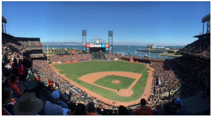
Figure 3: AT&T Park

Also nearby is AT&T Park, the home of the San Francisco Giants, one of our local baseball teams, which boasts beautiful views of the water. Other Nor-Cal professional teams include; Oakland Athletics (MLB), Oakland Raiders (NFL- Moving to Las Vegas), San Francisco 49ers (NFL moved to Santa Clara), San Jose Earthquakes (MLS), San Jose Sharks (NHL) and the Sacramento Kings (NBA).