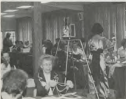
New Orleans members throw Mardi Gras favors to 99s attending the meeting.