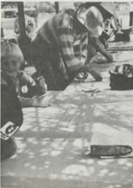
Kite-making was a popular activity at the Section Meeting.