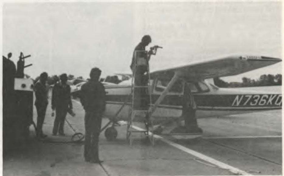
The 'Ramp Rats' made sure each plane was in order and the tanks were topped off.

was wrong . . . at least for a few hours. The racers departed Norman bound for Durant, in southeast Oklahoma, then over to Eufaula, the land of lakes in the east central part of the state, and finally back to Norman's more central locale. And then, in the eternal tradition of "perfect timing", the last plane returned to the roost and the rains came. All day and all night long. But absolutely nobody cared. We had done it! First-timers and all, we had conducted a small, but highly successful race and it was just like Phyl had promised. We had all had