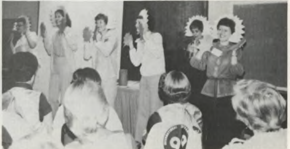
These little sunflowers are actually Kansas Chapter members issuing a graphic invitation to South Central Section members to attend the fall SC Section meeting to be held in Wichita, KS.