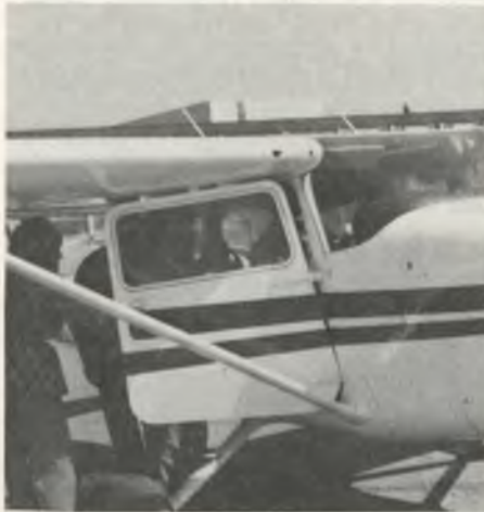
Passengers climb eagerly into Sarah Pearl's plane. Sarah, who is a new candidate for chapter membership, has acquired over 200 hours and most of her ratings in less than 6 months time!

The trip to South County Airport in San Martin was short but the somewhat bumpy air and testy crosswind required some concentration on landing. After dining at the famous Flying Lady Restaurant surrounded by a beautiful 18-hole golf course in the foothills of this rural community, a tour of the nearby Aviation and Automobile Museum completed the day. This airport which is situated only 23 miles southeast of San Jose offers accessibility to this restaurant and recreation area complex by only a telephone call from the airport for the car's station wagon. The day we visited all but a few tie downs were full. The young man who drove the station wagon into which we stuffed 13 adults said he had put over 200 miles on the car making trips to the airport that day between 1:00 p.m. and 4:00 p.m., and the distance is only 4 miles to the restaurant. We were all intrigued by the several hundred large scale models of famous aircraft that made a hanging collage from the restaurant ceiling.