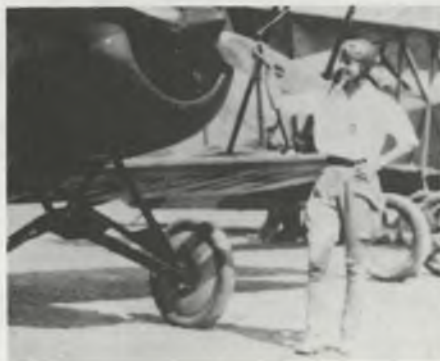
Line-Check for that famous altitude record flight by Louise Thaden in December, 1928.