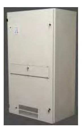
Typical Central Emergency Power Sources with a 10-year Manufacturer's Estimated Service Life Battery