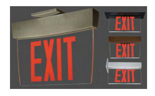
Figure 2-3. Typical Egress Marking Units

NOTE : All new and replaced internally illuminated egress markings must be ENERGY STAR® compliant.