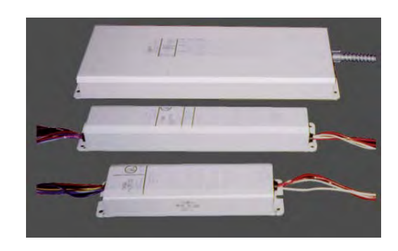
Typical Emergency Light Units and Florescent Fixture Ballasts with a 10-year Manufacturer's Estimated Service Life Battery