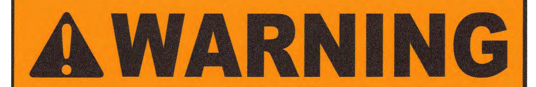
Figure 1-1. System Out-of-Service or Impaired Sign