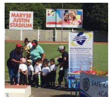
Globelink Mauritius participating as a site sponsor for Safe and Sound Academy's Children's Day event