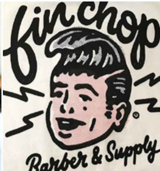
FIN CHOP Multiple print tee collection - Art by The Critical Slide Society