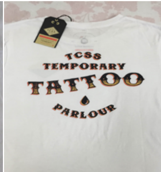
TEMPORARY TATTOO PARLOUR 3 colour 2 sided T-shirts - Art by The Critical Slide Society