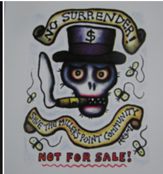
MILLERS POINT PROTEST 4 col CMYK T-shirts & Posters - Art by Reg Mombassa