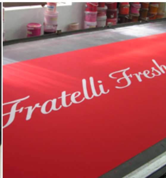
FRATELLI FRESH 1 col white 1.4m print on 3m outdoor canvas awning