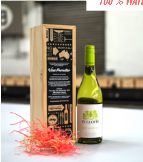
VINO PRADISO 2 colour 1 sided wooden box - Art by Our Friends Electric

100 % WATERBASED INKS 'SPECIALISTS' for FILM, PROMO, POS, FASHION, STREET, MARKETING & PR