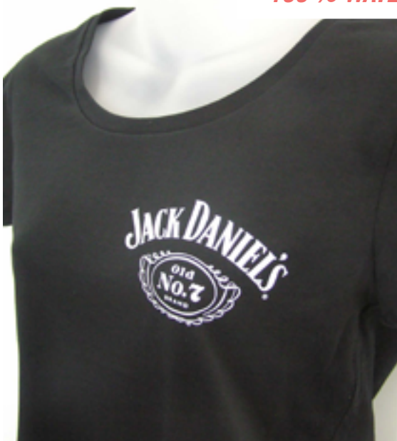
JACK DANIELS - OLD No7 1 col white on variety of shirts - Art by Brown Forman

100 % WATERBASED INKS 'SPECIALISTS' for FILM, PROMO, POS, FASHION, STREET, MARKETING & PR