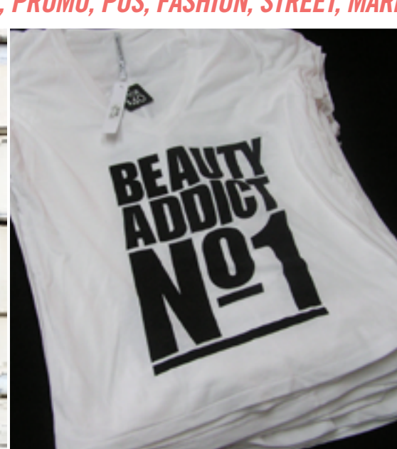
BEAUTY ADDICT 1 colour T-shirts - Art by Bauer Media