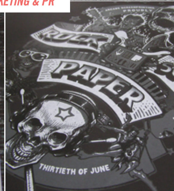
ROCK SCREEN PAPER 1 EXHIBITION 3 colour poster print - Art by Blair Saya & Ben Brown