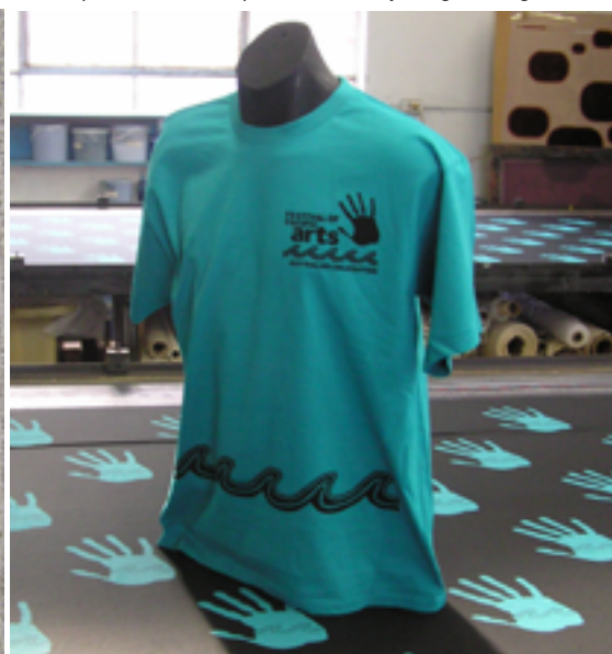
FESTIVAL PACIFIC ARTS 1 col 3 position t-shirts / polos / Custom yardage sarongs