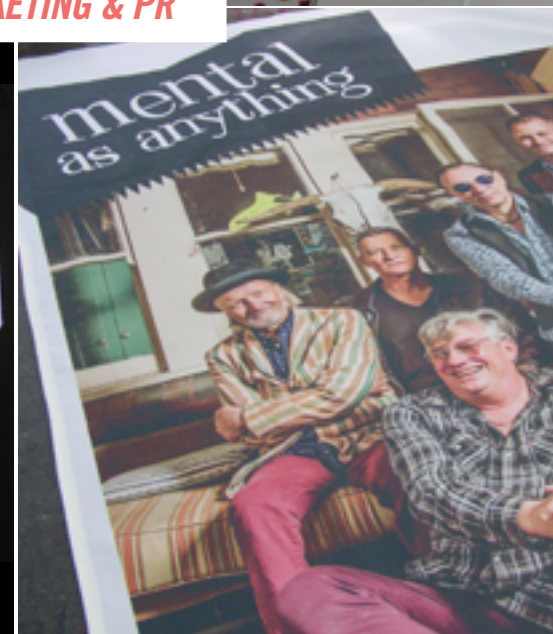
MENTAL AS ANYTHING / PETERSHAM BOWLO Digital Banners & one colour T-shirt merch range

Our customers are usually design driven. Many are Designers or PR companies who work with multiple brands ... ...there are too many to show here and many are private, what we like is they know, drive and thrive on design. Feel free to share this brochure with friends / click anywhere to jump to our website!