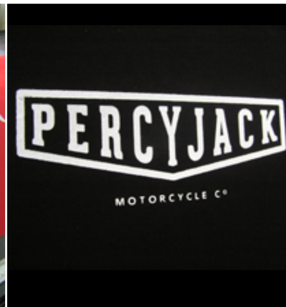
PERCY JACK MOTOR CYCLES 1 col white on T-shirts & Hoodies + reversed digital banner x 2m