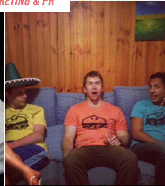
PARTY CREW SHIRTS 1 colour print multi colour Tees