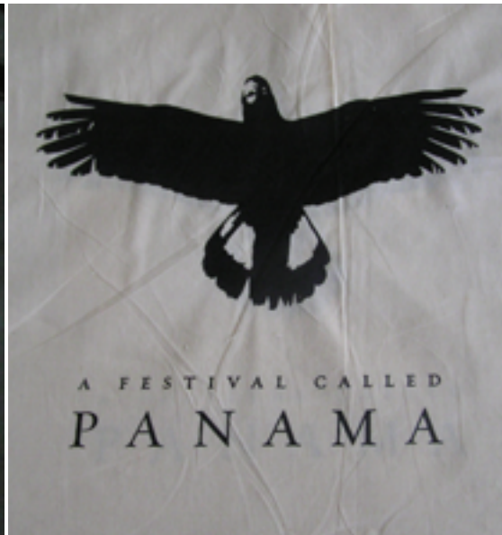
PANAMA FESTIVAL TASMANIA 1 colour black on tote bags / banners - Art by Georgie Armstrong