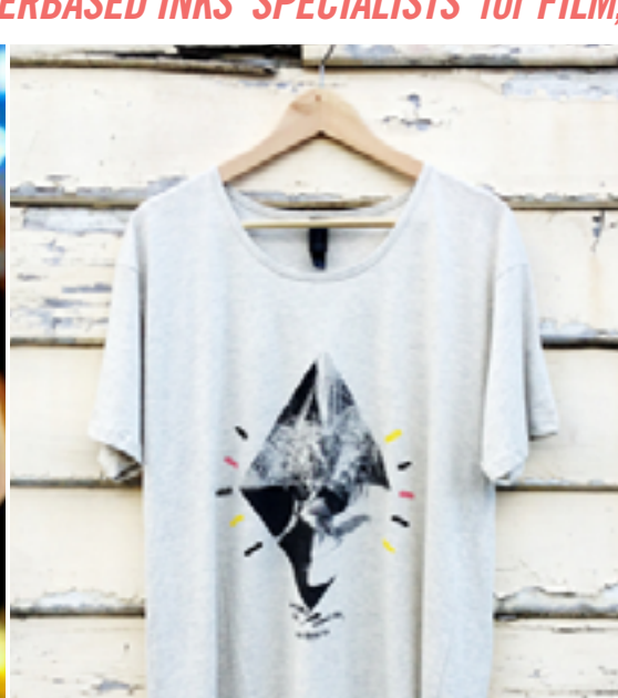
THE TREEHOUSE / BEDS AND SLEDS 5 colour front - Art by Simon Perini