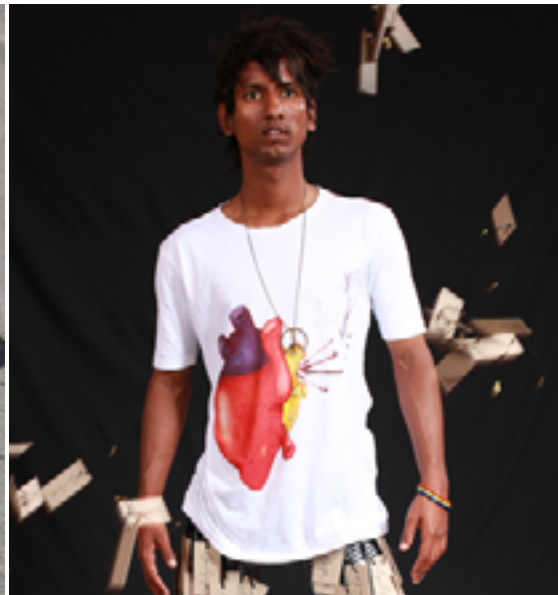
DON'T SMOKE TEE 4 col CMYK on custom Tee - Art by Nathan (Mon Amie)