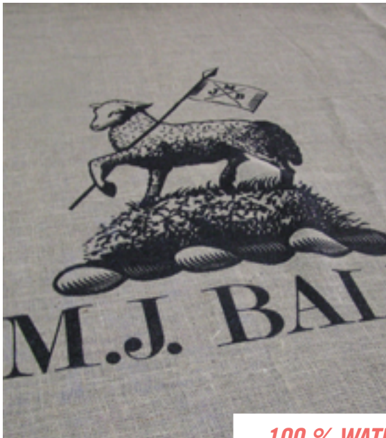
M.J. BALE 1 colour 3m x 1.2m hessian wall - Art by M.J. BALE