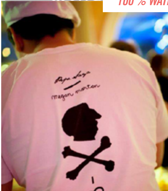
PEPE SAYER CULTURED BUTTER 1 colour 2 sided - Art by Pepe Sayer & Steve Woods (Arcade)

100 % WATERBASED INKS 'SPECIALISTS' for FILM, PROMO, POS, FASHION, STREET, MARKETING & PR