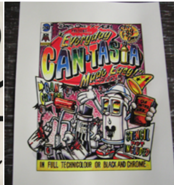
CAN-TAS-IA EXHIBITION 4 col CMYK T-shirts & Posters - Art by Days One & KON