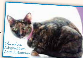
Sheeslee Adopted from Animal Humane