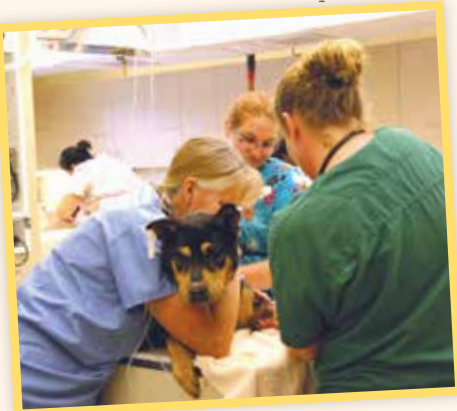
A dog resident being prepped for spay/neuter surgery

Our Humane Education Outreach Program has grown significantly over the years. While many classes are held on school campuses, we also host many community and school tours. We have only one large meeting room available to accommodate staff and volunteer functions along with training and education classes. Scheduling this single shared space proves difficult. Having an additional large multi-use room will enable us to offer more humane education K-12 classes and special training programs on our campus.