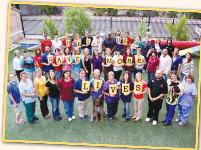
Animal Humane Staff

Our programs and services have grown dramatically over the past five years and so has our staff. We have outgrown our current office and meeting space. Bathrooms have been converted to offices, while some offices are time-shared. To avoid staff burnout, we need more space where our staff can think clearly and work effectively on behalf of the homeless pets we serve. Our current administrative offices will be relocated on our campus to create a new Volunteer Center to accommodate the recruitment and management of our growing (400+) volunteer base.