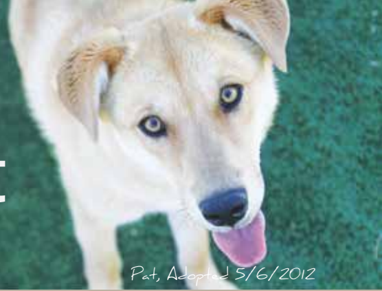
Pat, Adopted 5/6/2012