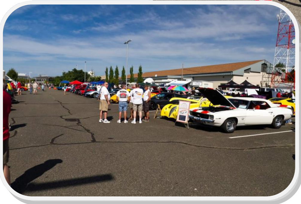
Classical Glass Corvette Club