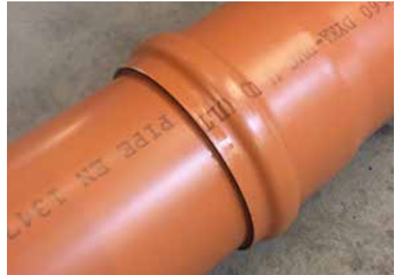
110mm ULTRA3 pipe fitted together

Pipes should be laid with the socket at the upstream end. The contractor must ensure the spigot and socket to be connected are clean and free from debris. JDP lubricant should be liberally applied to the spigot and the seal within the socket. The pipes should then be aligned correctly and pushed together until the spigot is fully inserted.