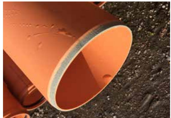
110mm chamfered edge