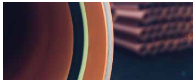
Recycled core of ULTRA3 pipework

Provides safer & easier handling on site and a reduced carbon footprint than alternative plastic systems.