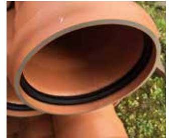
EN 13476-2 pipework

EN 13476 has three subsections that cover performance, different manufacturing methods and style of pipework.