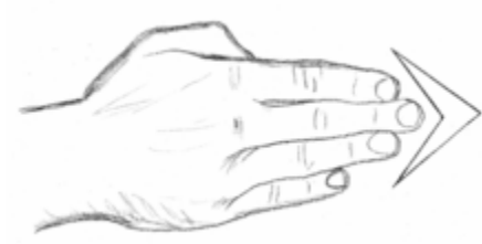
Figure 3: Illustration of spear hand technique.