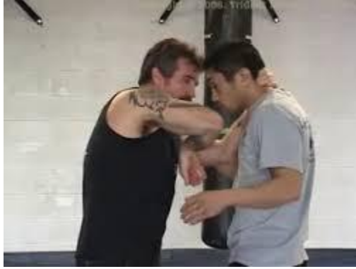
Figure 5: Grabbing the back of the assailant's head for extra power.*