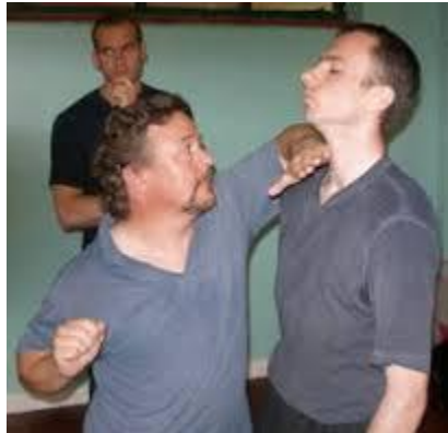
Figure 6: Elbow thrown from a downward angle.*

The elbow to the throat can also be used to create space from an opponent if you find yourself getting overwhelmed in the clinch position.