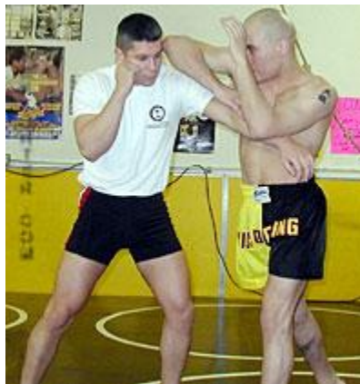
Figure 4: Straight elbow to the eye while defending with the non-attacking arm.*

An elbow to the eye is another effective -- yet basic -- technique that just might save your life in a street fighting situation. Typically thrown at close range, this move is well-known for knocking people out, opening nasty cuts around the eye region, thus impairing the assailant's vision, and, even, leading to temporary or permanent blindness.