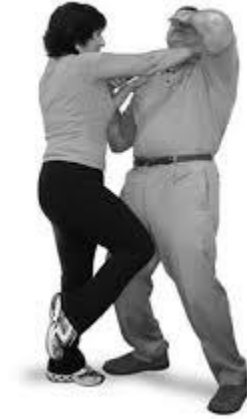
Figure 14: Knee to the groin.

To execute this move, simply raise your knee towards your opponent's groin, making contact with the top of the knee.