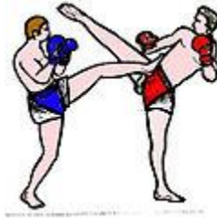
Figure 12: Push kick to the Groin.

instead, it creates space between you and your opponent, giving you the opportunity to launch another attack.