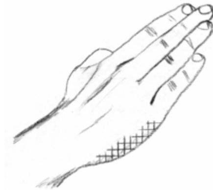
Figure 7: Proper knife hand form. Contact should be made with the shaded area.

To execute the knife hand, straighten and stiffen the four fingers while tucking the thumb in the palm.