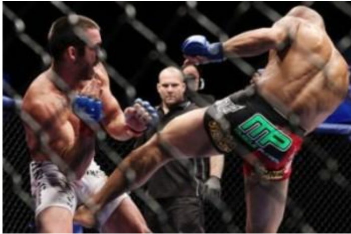
Figure 11: Even professional MMA fighters love the inside leg kick.*

Take away the protective gear, and a crisp inside leg kick to the groin is enough to drop a man.