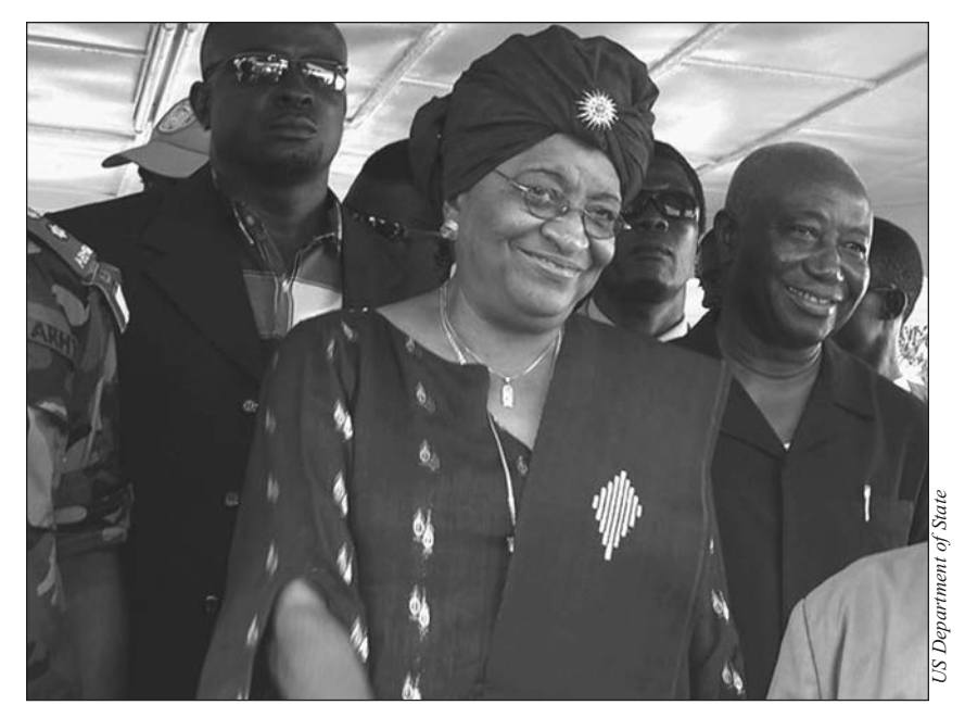
Liberian president Ellen Johnson Sirleaf is the first elected female head of state in Africa, serving from 2006 to 2018.

to explain general trends while at the same time being mindful of elements unique to a specific African region or country. Toward this end, a second theme of this book is that a comprehensive understanding of contemporary Africa requires a continental perspective inclusive of all five regions of the African continent. Specifically, one must focus on both North Africa, often referred to as Saharan Africa, as well as the four regions of Central, East, Southern, and West Africa, typically referred to as sub-Saharan Africa (see Map 1.2). Traditional studies of the African continent often focus exclusively on sub-Saharan Africa. This is due to the argument that several dimensions of contemporary North Africa, such as the greater influence of Arab culture and Islam, combine to make that region unique and, therefore, noncomparable to neighboring regions in the south. Although we recognize that specific geographical regions, countries, and even regions within countries may embody varying degrees of uniqueness, this book nonetheless seeks to examine the continental trends that transcend individual regions and thus provide us with a comprehensive understanding of contemporary Africa.