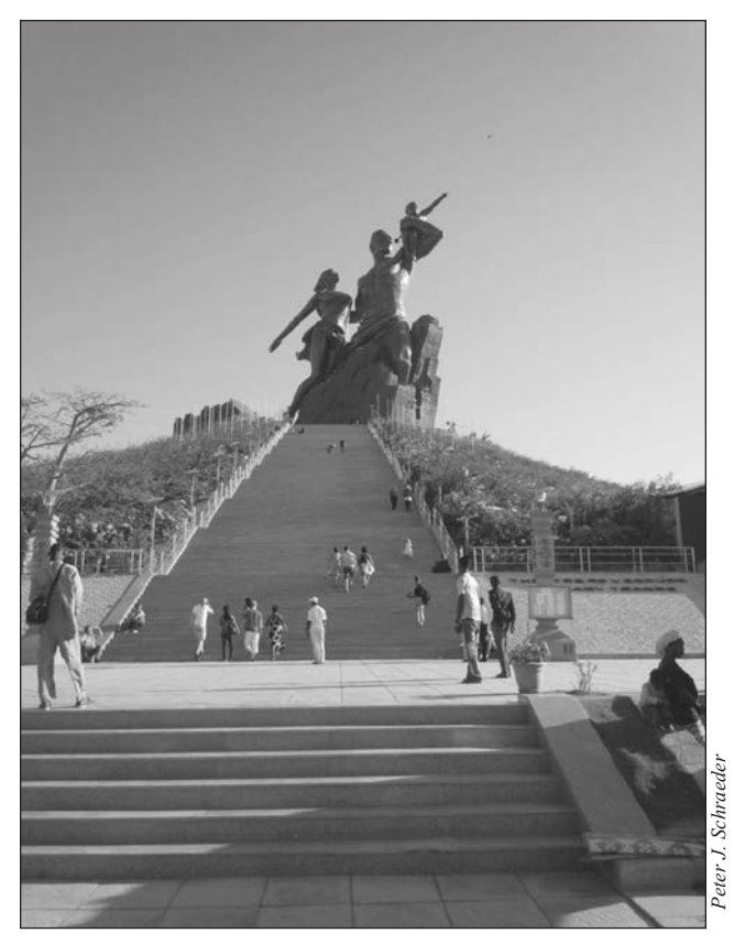
Monument to the African Renaissance, located in Dakar, Senegal.

Africa's natural regions, and contemporary geographic challenges. Chapter 3 by Thomas O'Toole and Kirstie Lynn Dobbs provides the historical backdrop of contemporary Africa. They set out the "peopling of Africa" (including Africa's role as the "cradle of humankind"); the rise and fall of centralized and stateless polities throughout African history; the era of trade, exploration, and conquest; and the imposition of colonial rule.