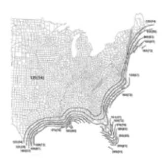
Figure 2.2 IBC Basic Wind Speeds: Basic Wind Speeds: Risk Category III and IV.