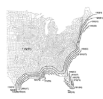
Figure 1.1 IBC Basic Wind Speeds: Basic Wind Speeds: Risk Category II. Source: ASCE 7-10

The United States wind speed map provides information on basic wind speed in miles per hour in geographic zones. The basic wind speed maps are categorized based on Risk Category I, II, III and IV. Risk Category is selected based on the Use or Occupancy of Buildings and Structures. Please refer to ASCE 7-10, Table 1.5-1 for details. Standby power system is usually considered in Risk Category II or III and IV. Figures 1 and 2 show basic wind speed versus geographic regions in the United States for Risk Category II, III and IV, respectively. The first step is to identify the Risk Category based on the Use or Occupancy factor based on ASCE 7-10. Table 1.5-1 is used to determine the installation location's basic wind rating speed. While most of the United States has a basic wind rating speed of 110 miles per hour, special regions, particularly along the Atlantic and Gulf coasts, have ratings of up to 186 miles per hour. Figure 1 shows basic wind speed versus geographic regions in the United States.