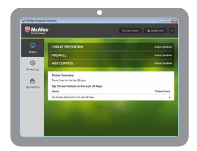
Figure 2. The McAfee Endpoint Security 10 user interface is highly intuitive, easy to navigate, and features support for touch screens.

The McAfee Endpoint Security 10 client interface is modern, touch-friendly, and designed to address the needs of users, help desk administrators, and McAfee ePO software administrators. The client is also modular—only the modules that are installed on the client appear in the interface.