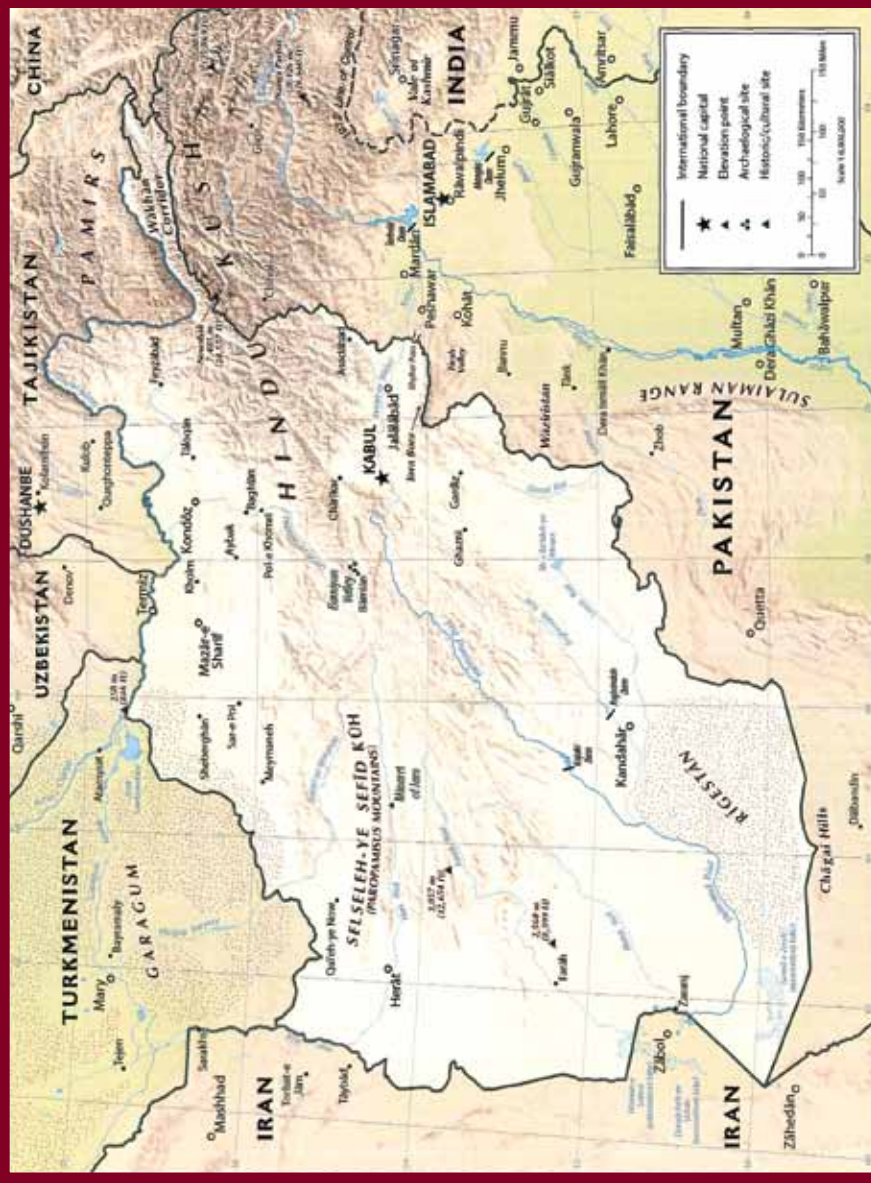
LAMBERT CONFORMAL CONIC PROJECTION; STANDARD PARALLELS 30°25'N 37°10'N 803282A1 (G00878) 405