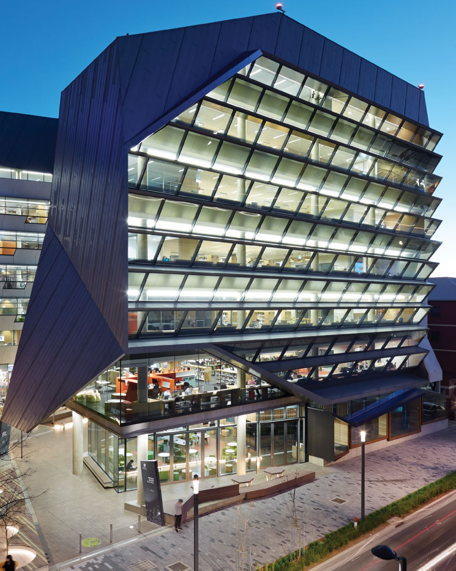
Image: The award-winning Jeffrey Smart Building at UNISA's City West campus.