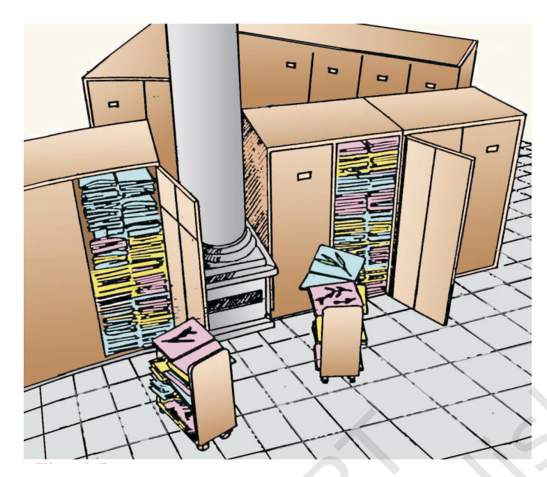
Figure 1.2 Herbarium showing stored specimens

according to a universally accepted system of classification. These specimens, along with their descriptions on herbarium sheets, become a store house or repository for future use (Figure 1.2). The herbarium sheets also carry a label providing information about date and place of collection, English, local and botanical names, family, collector's name, etc. Herbaria also serve as quick referral systems in taxonomical studies.