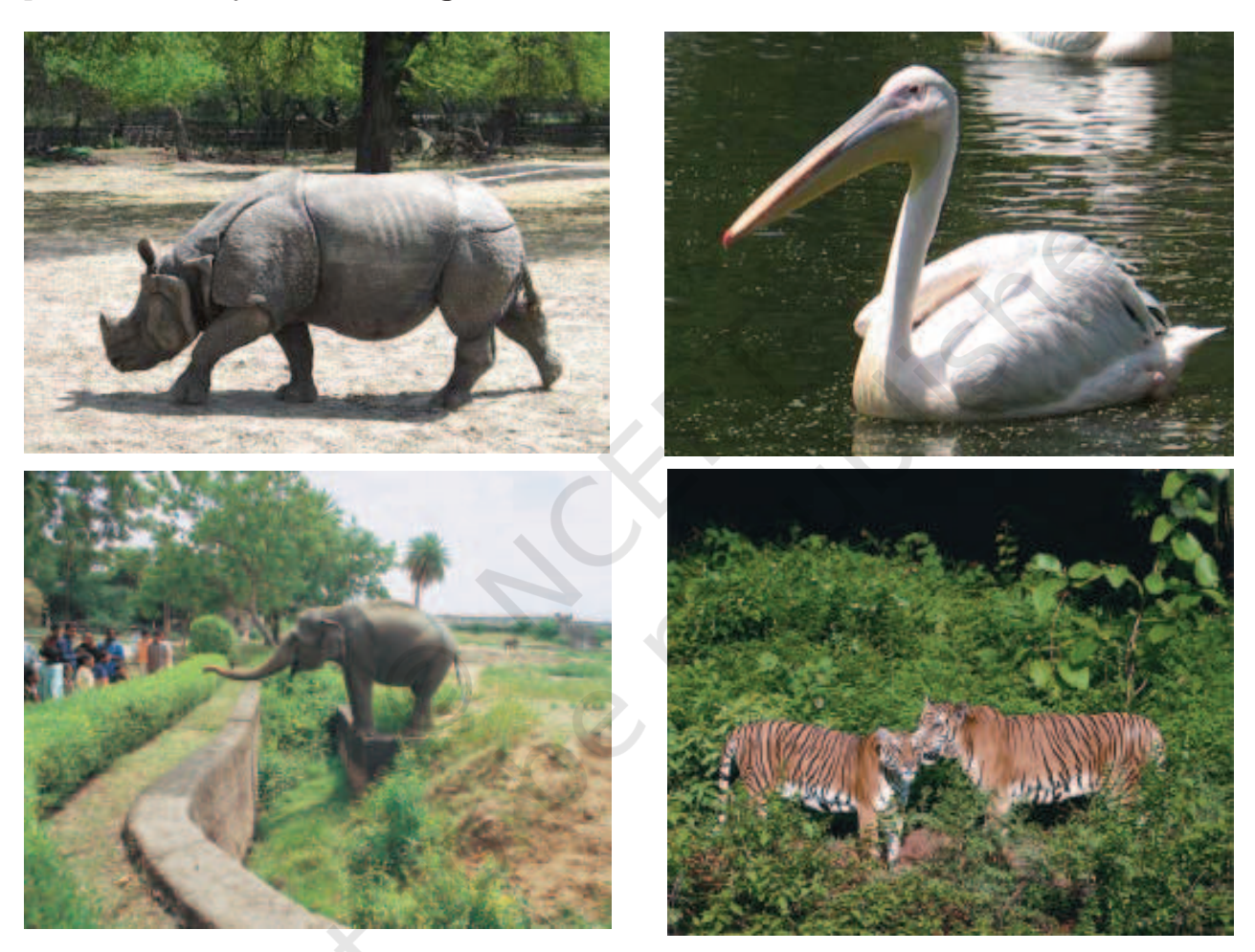
Figure 1.3 Pictures showing animals in different zoological parks of India

These are the places where wild animals are kept in protected environments under human care and which enable us to learn about their food habits and behaviour. All animals in a zoo are provided, as far as possible, the conditions similar to their natural habitats. Children love visiting these parks, commonly called Zoos (Figure 1.3).