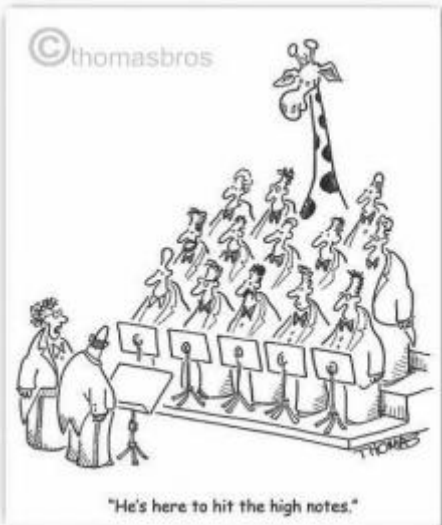
"He's here to hit the high notes."

The next drawing is December 13, 2021 and the Knights of Sacred Heart and St. Andrew ask you to keep selling and buying tickets. Still just $1 and more tickets are available at the rectory. The prize is the same~$250 gift card from the Parish! Thanks to you and this raffle, needy families of all three churches will have a happier holiday season.