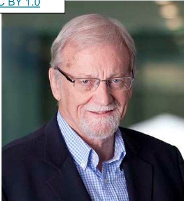
Gareth Evans

Gareth Evans was one of Australia's longest serving _____ Ministers, best known internationally for his role in helping to develop the UN peace _____ for Cambodia. In fact, Evans won the ANZAC Peace _____ in 1994 for his work on Cambodia. Evans believes that 'Negotiating and implementing a durable peace in Cambodia remains one of the United Nations' _____ achievements.'