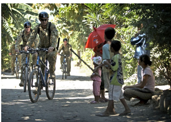
Australian soldiers in East Timor CC BY 2.0

Australian peacekeepers were involved in: