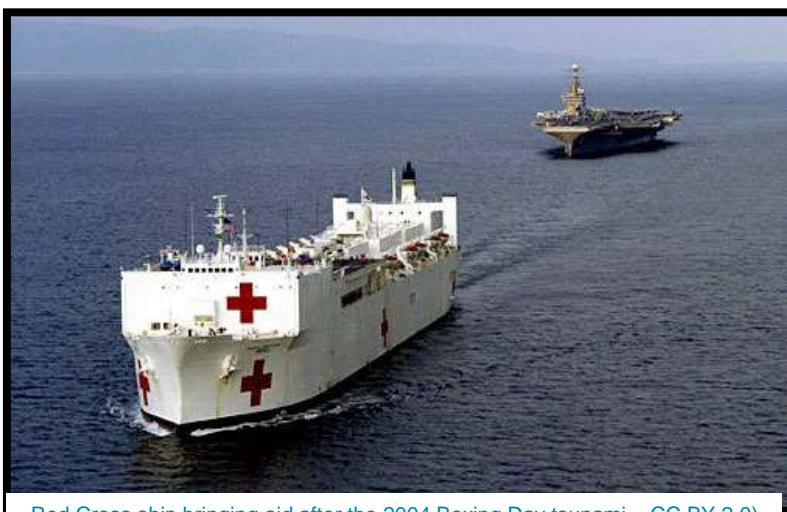
Red Cross ship bringing aid after the 2004 Boxing Day tsunami. CC BY 2.0