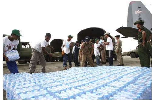
Above: Burmese service members and civilian aid workers providing bottled water.