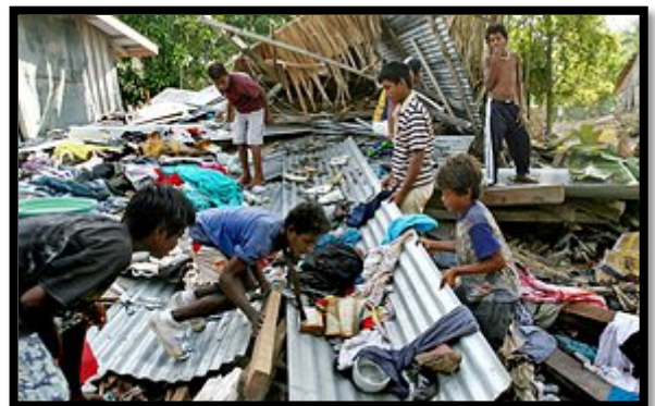
Children hunt for clothes in the wreckage after a tsunami. Solomon Islands.