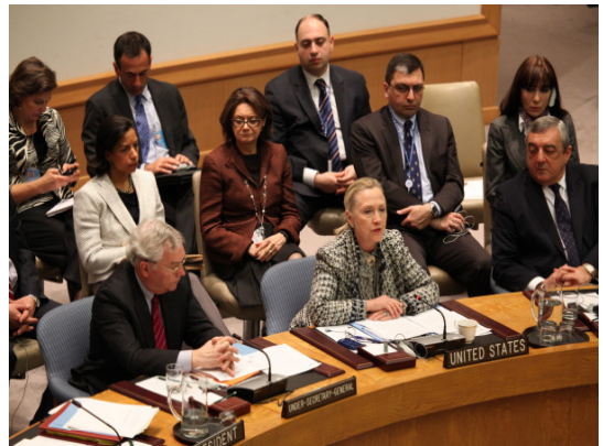
United Nations Security Council in session, 12 March 2012