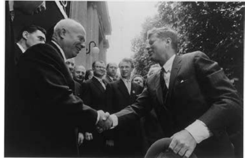
President. J. F. Kennedy and Chairman N. Khrushchev