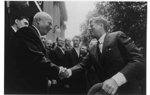
President J. F. Kennedy and Chairman N. Khrushchev

Up until the end of the Cold War, the UN only involved itself in conflict if two or more member states were involved. This is known as the principle of non-interference. The enthusiasm for United Nations and world peace was quickly dampened by the Cold War, which had divided the world into East versus West. This conflict made constructive work in the UN Committees very difficult during the first decades of its existence.