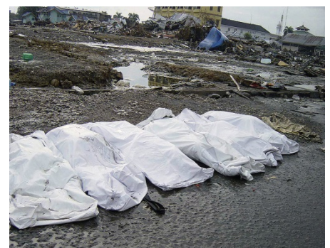
Shrouded bodies of the deceased Banda Aceh 2004.