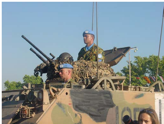
Australian Peacekeepers in Timor

By the end of the 20 th century Australia had provided nearly 15 000 soldiers for United Nations’ peacekeeping missions.