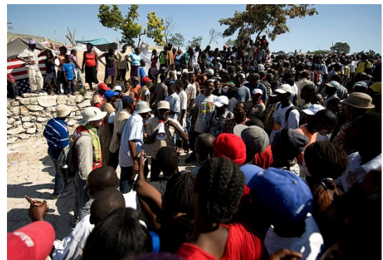
Haitian earthquake survivors wait to receive non-perishable goods from a Red Cross distribution site in Port-au-Prince, Haiti, Jan 25, 2010