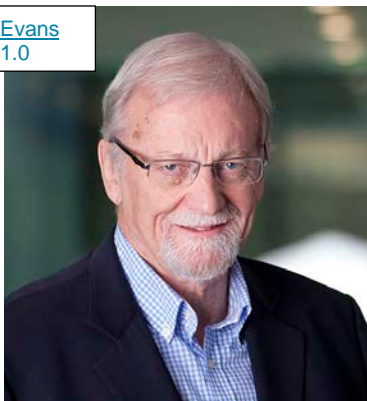
Gareth Evans CC BY 1.0

Gareth Evans was one of Australia’s longest serving Foreign Ministers, best known internationally for his role in helping to develop the UN peace plan for Cambodia. In fact, Evans won the ANZAC Peace Prize in 1994 for his work on Cambodia. Evans believes that ‘Negotiating and implementing a durable peace in Cambodia remains one of the United Nations’ finest achievements.’