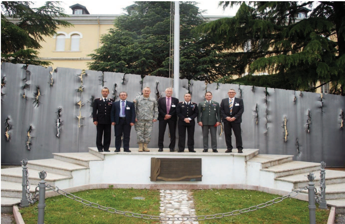
Military experts of the UN Peacekeeping Missions Military Police Unit Manual Working Group, Italy 2014.