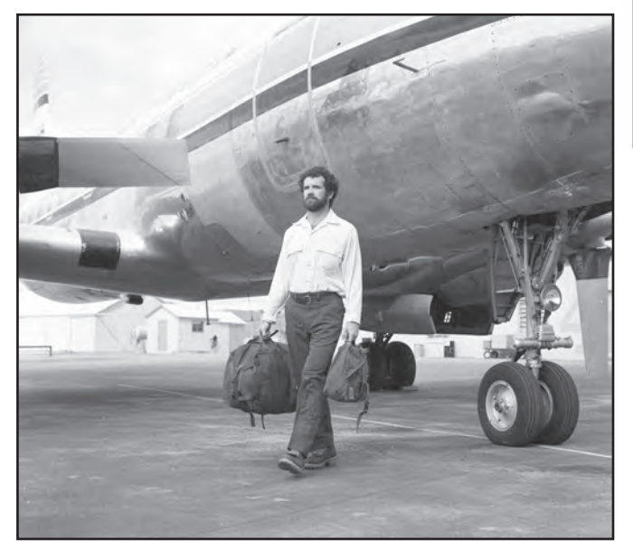
Figure 1 - A firefighter using an early model personal gear pack.

'ildland firefighters and other field personnel are often required to travel away from their home bases, and the amount of personal gear they can carry may be limited. Typical assignments may last a few days or for as long as 2 or more weeks, and accommodations can range from a room in a hotel to a backcountry camping situation. Determining an optimal pack for carrying and storing as much as 2 weeks' worth of personal equipment can be challenging (figure 1). A personal gear pack that is too small may require lashing items to the outside. A pack that is too large may not meet weight and bulk requirements.