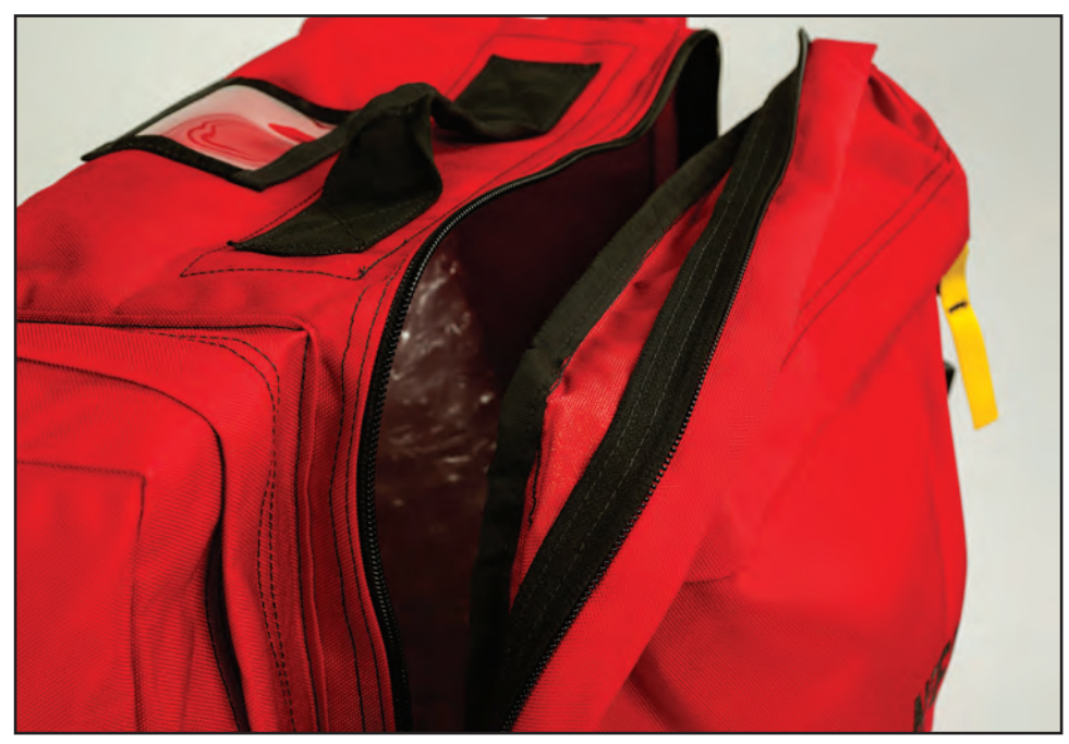
Figure 9-Inside seams have binding sewn onto the edges in high-wear areas.