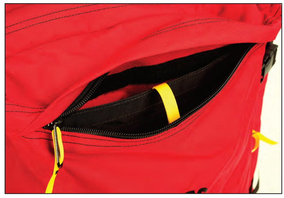
Figure 8-Internal organizer pocket for securing smaller items.