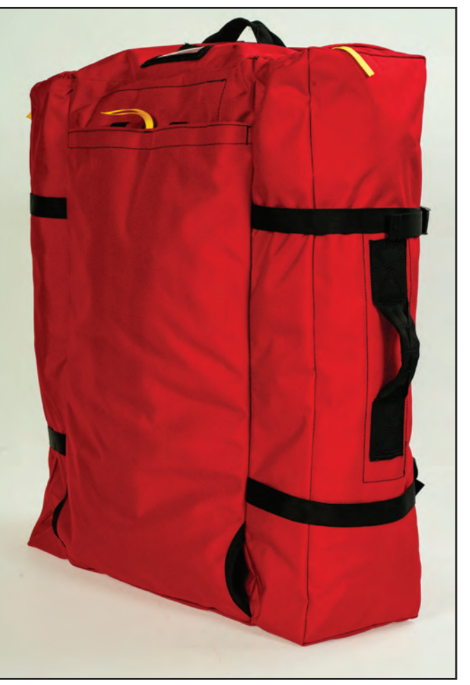
Figure 7-Stowable backpack straps and waistbelt.