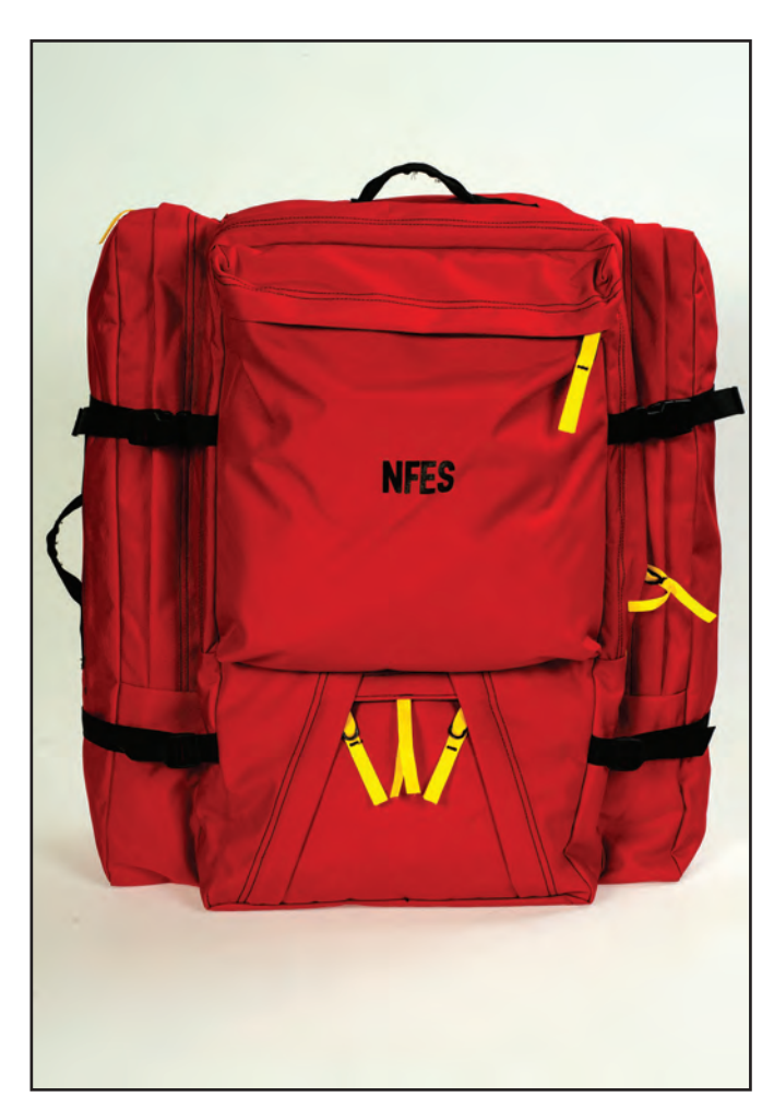
Figure 5-Front view of the M-2014 personal gear pack.

The M–2014 personal gear pack, National Stock Number (NSN) 8465-01-647-6670 (NFES no. 0679) (figure 5), is available through the Defense Logistics Agency's Wildland Firefighter Equipment Catalog at a cost of $96.03 (2017 price). The finished pack dimensions are 25 inches high by 22 inches wide by 10 inches deep, which meets commercial aircraft size restrictions to avoid oversize baggage charges. The total pack volume is 5,215 cubic inches.