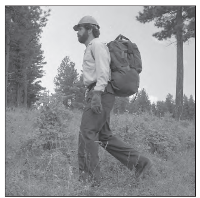
Figure 2—The 1983 personal gear pack developed by the Missoula Equipment Development Center.

In 1987, MEDC implemented some minor design changes. MEDC personnel removed the top handle, reducing the cost. They added small buckles on the lower corners, allowing the user to attach the firefighter field pack (fireline pack). They also replaced the thread-through buckles on the zipper compression straps with quick-release (side release) buckles (figure 3).