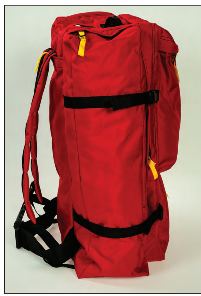
Figure 6-Padded shoulder straps and waistbelt.