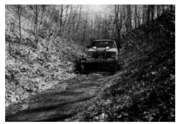
Figure 8. Raking horse trail.

Each forest reported that the rake fit their current needs; personnel who used the rake said they would continue its use. It is an inexpensive piece of equipment that does many things well and is a good fill-in between traditional maintenance equipment contracts. The rake is cost effective and available when needed.