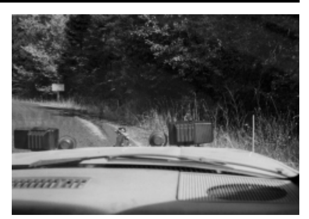
Figure 7. Marker on right-hand-side of rock rake as viewed from cab of vehicle.

Effective use of the rake requires the enhanced traction and power offered by a 4-wheel-drive vehicle. One test Forest used a 2-wheel-drive vehicle instead of the recommended 4-wheel-drive vehicle and was unable to rake in the uphill direction on a