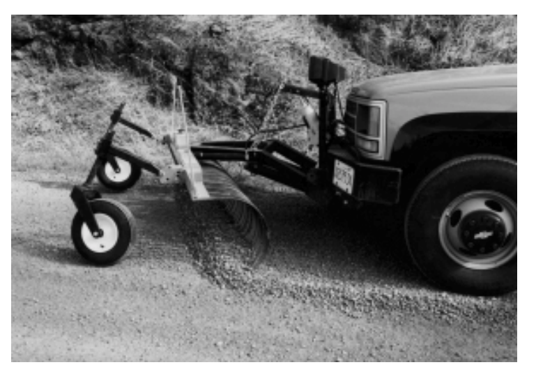
Figure 1. The rake installs to the front of a vehicle using a snowplow attachment.

The rake installs to the front of a vehicle using a snowplow attachment (figure 1). The vehicle specifications, including snowplow attachments by Region, are included in table A.1 of the appendix. The instruction manual provided by the manufacturer is helpful and should be read prior to starting the installation. The rake weighs 600 to 850 pounds and therefore requires two people to perform the work safely. One test Forest used a hoist and fork lift to facilitate removal and mobilization of the attachment. A level area is needed to facilitate easy installation and removal of the blade. Problems encountered by the test Forests