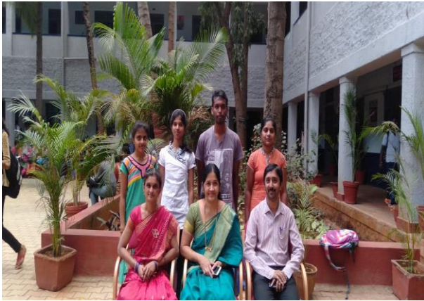
Students Selected in the Wipro Campus