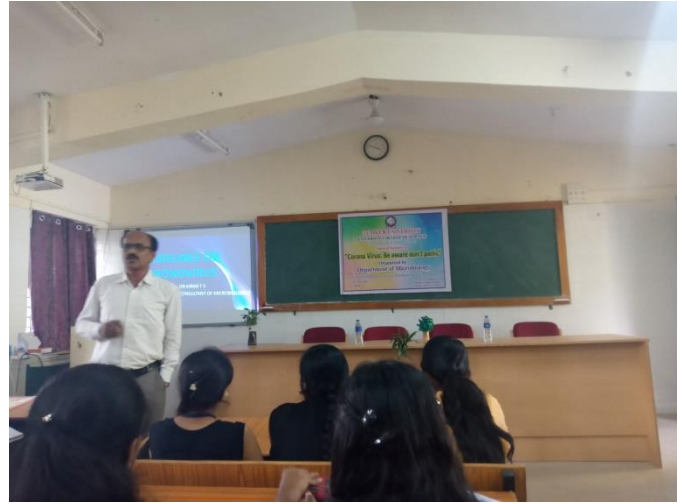
Department of Microbiology Organized Special talk on COVID-19