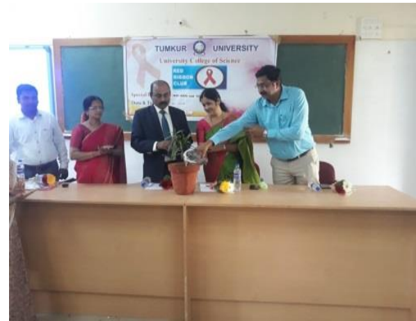
Red Ribbon Club Inauguration