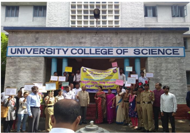
Plastic and Waste Free Campaign