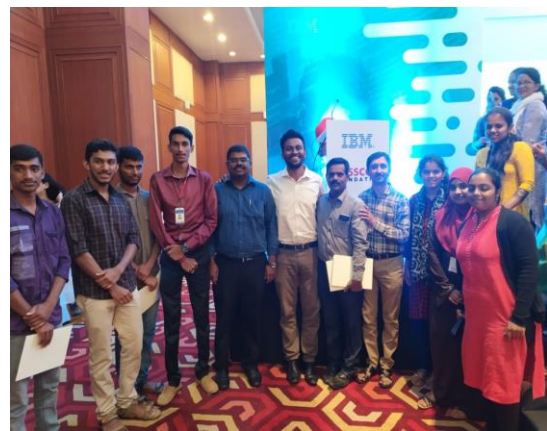
Placement training and Certification by IBM, Bengaluru