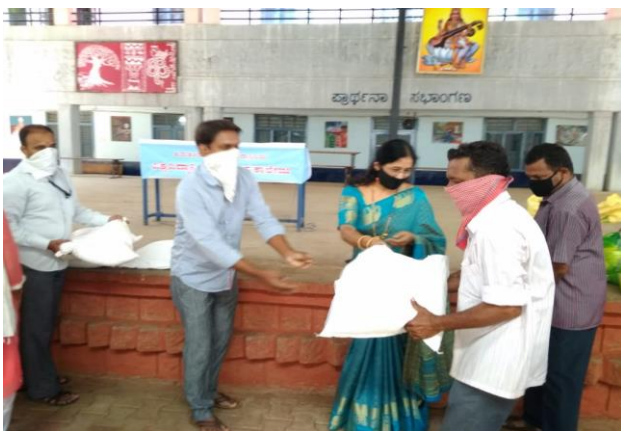
Food Bags Distribution to College Out Source Employees