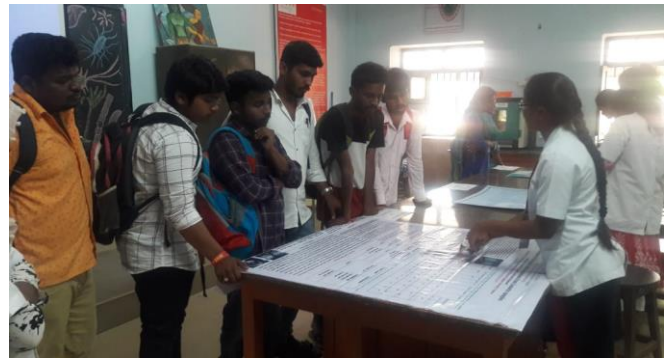
Department of Microbiology Science Day Celebration