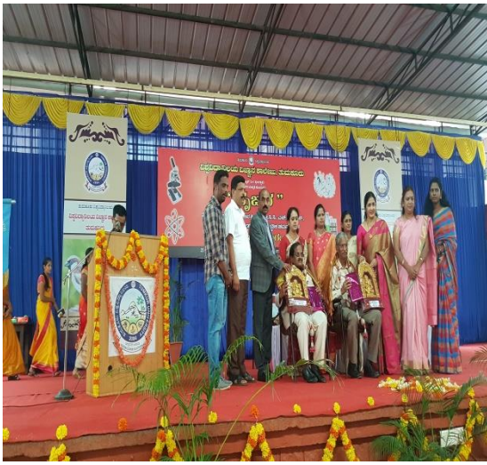
College Inaugural Function