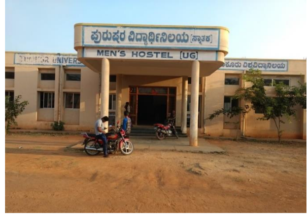
PG/UG Boys Hostel