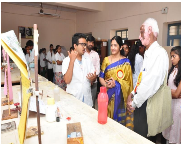
Science Day Celebration