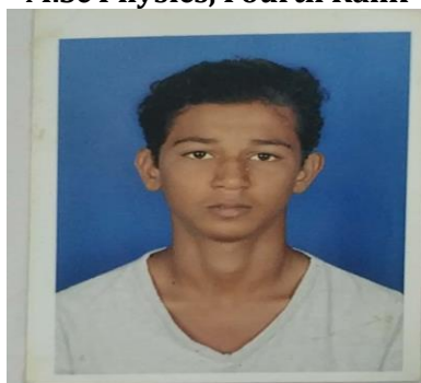
GURUPRASAD ST TOPPER IN B.Sc