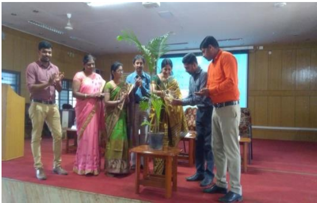
Career Guidance Programme by DISHA – Guidance Cell as a part of Entrepreneurship Development, Government of Karnataka