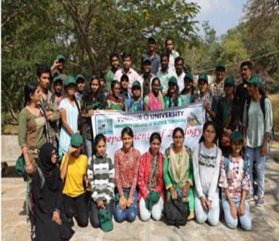
Workshop on “Bird Survey at Devarayanadurga State Forest” on 4/1/2020