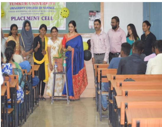
Placement training program by NUDGE foundation, Bengaluru