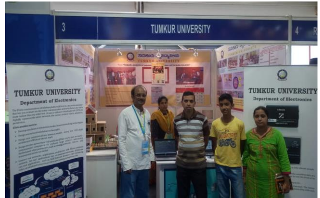
Participation of Department Of PG Studies and Research In Physics in 107 th Indian Science Congress focusing on rural development held at University of Agricultural Sciences, GVKK Campus, Bangalore On 3 rd Jan 2020 to 7 th Jan 2020 in the Tumkur University stall.