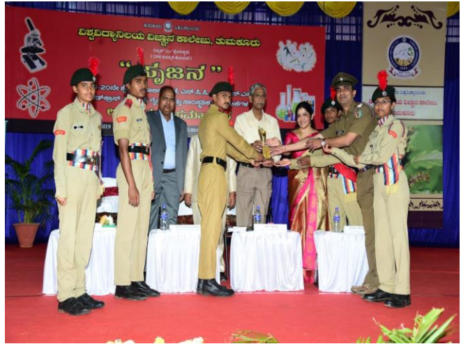
Inaugural Program of NSS Camp 2020