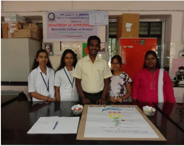
Department of Biotechnology Science Day Celebration