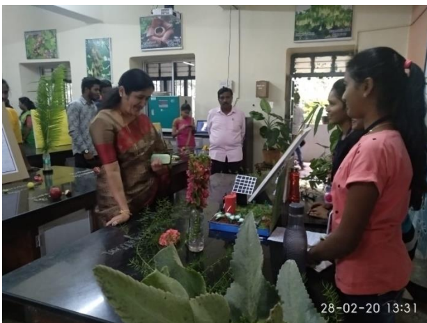
Department of Botany Science Day Celebration