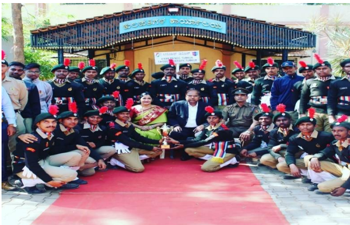
UCS NCC Contingent winning the Second Prize in the Independence Day 2019 March past 2019.