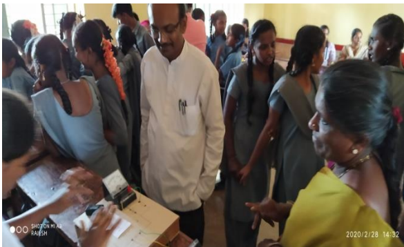
POPULARISATION OF SCIENCE PROGRAMME AND NATIONAL SCIENCE DAY AT SIDDAGANGA SCHOOL, AREYURU, TUMAKURU TALUK ON 28 FEBRUARY 2020.