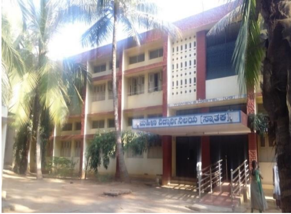
PG/UG Girls Hostel