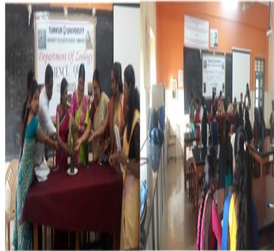
Department of Zoology Organized Science Quiz