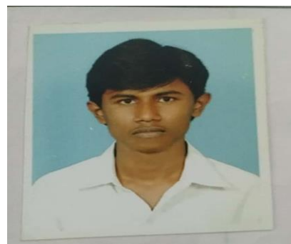
SAGAR SC TOPPTER IN B.Sc