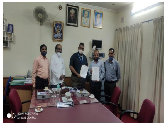
MoU with 32 Colleges and Industries including Shridevi Institute of Technology