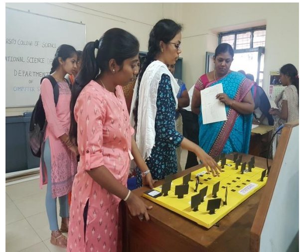
Science day Celebration by Department of Computer Science