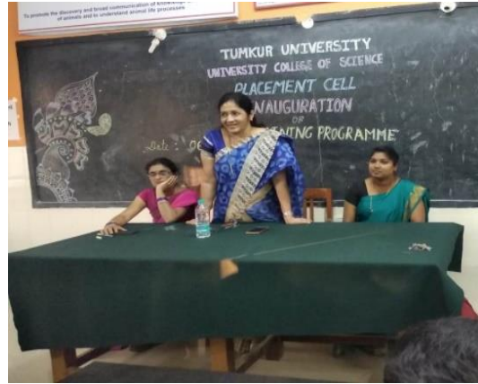
Inauguration of Placement Training Recruitment Drive Program by UNNATI, an NGO, Bengaluru