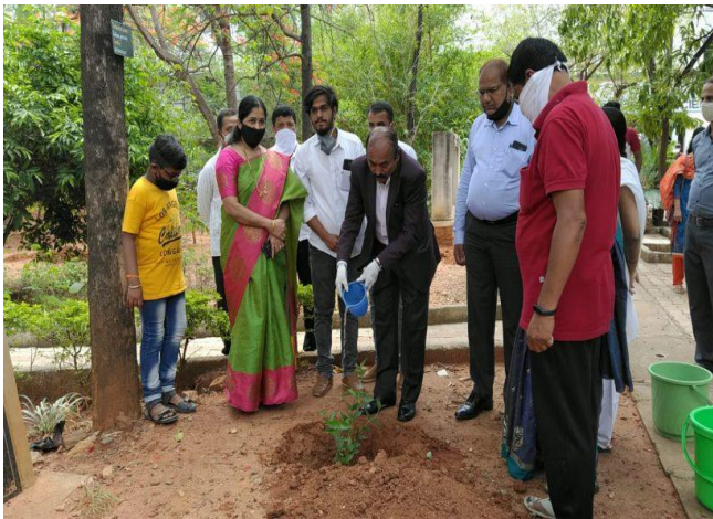
Environmental Day Celebration