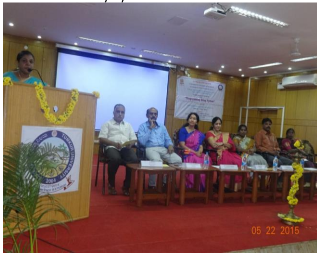
Department of Computer Science organizing Workshop on Programming using Python,