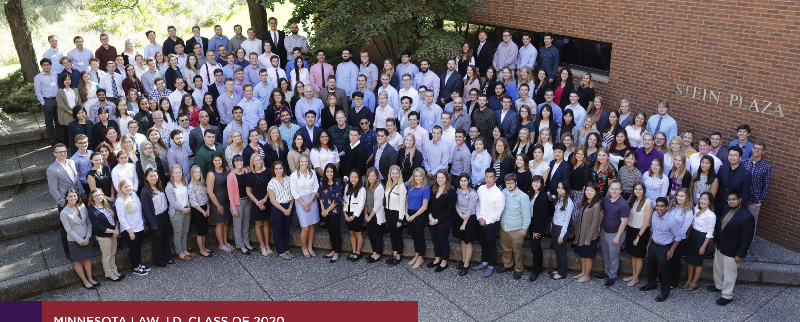
MINNESOTA LAW J.D. CLASS OF 2020