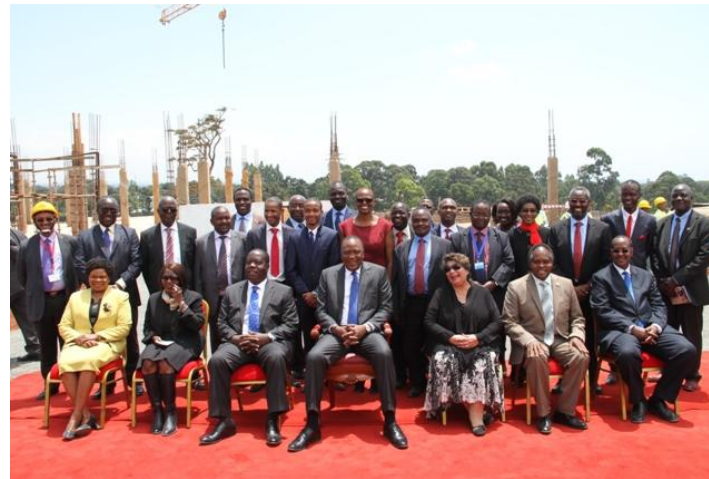
His Excellence, the President of Republic of Kenya, Hon. E. Uhuru Kenyatta, laying the foundation stone for the WMI on August 23, 2016