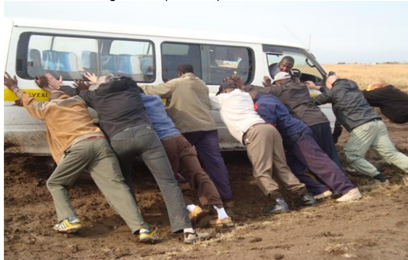
Students (left) holding a group discussion during the field training at Solio Ranch in March 2012, and on the right, students pushing a vehicle stuck in mud during the same occasion