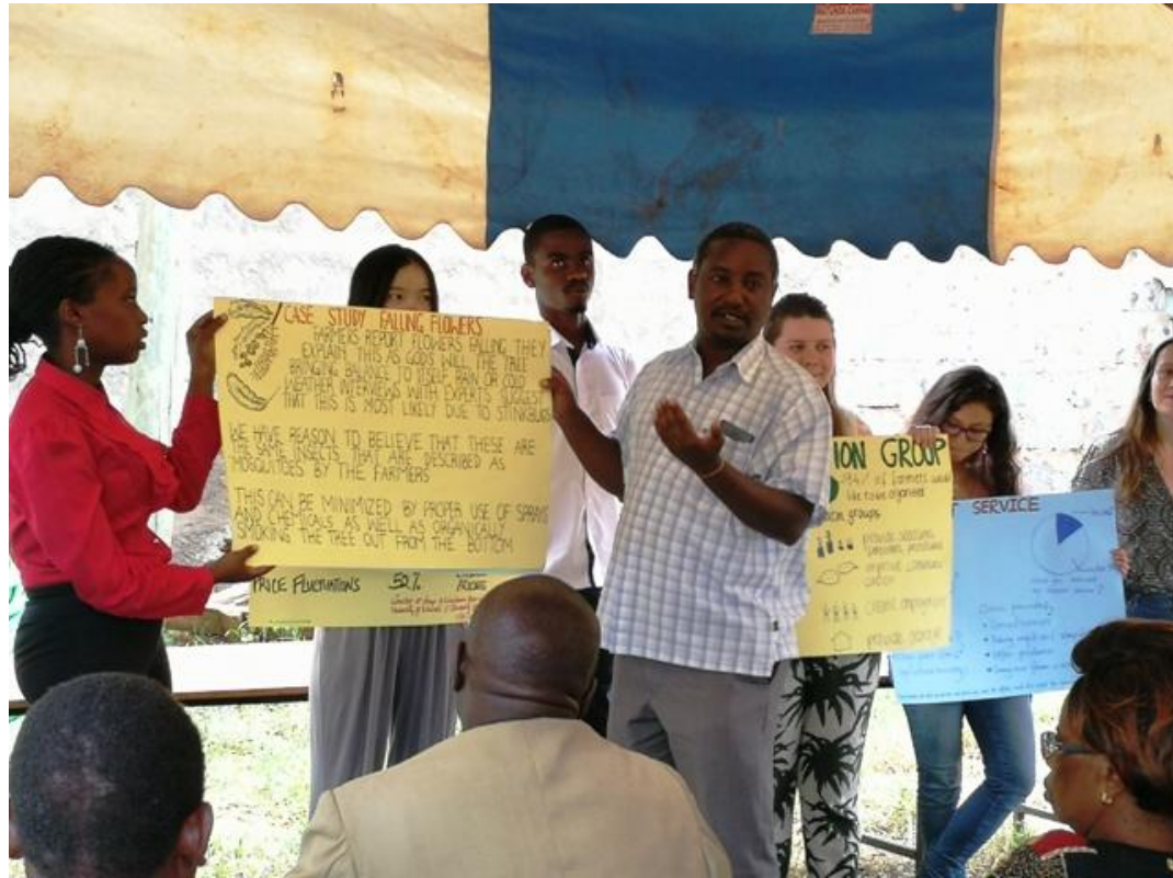
Students from the WMI-UoN, University of Copenhagen and Roskilde University, Denmark presenting their preliminary findings on macadamia farming in Kibugu, Embu county on March 11, 2019 after the field training