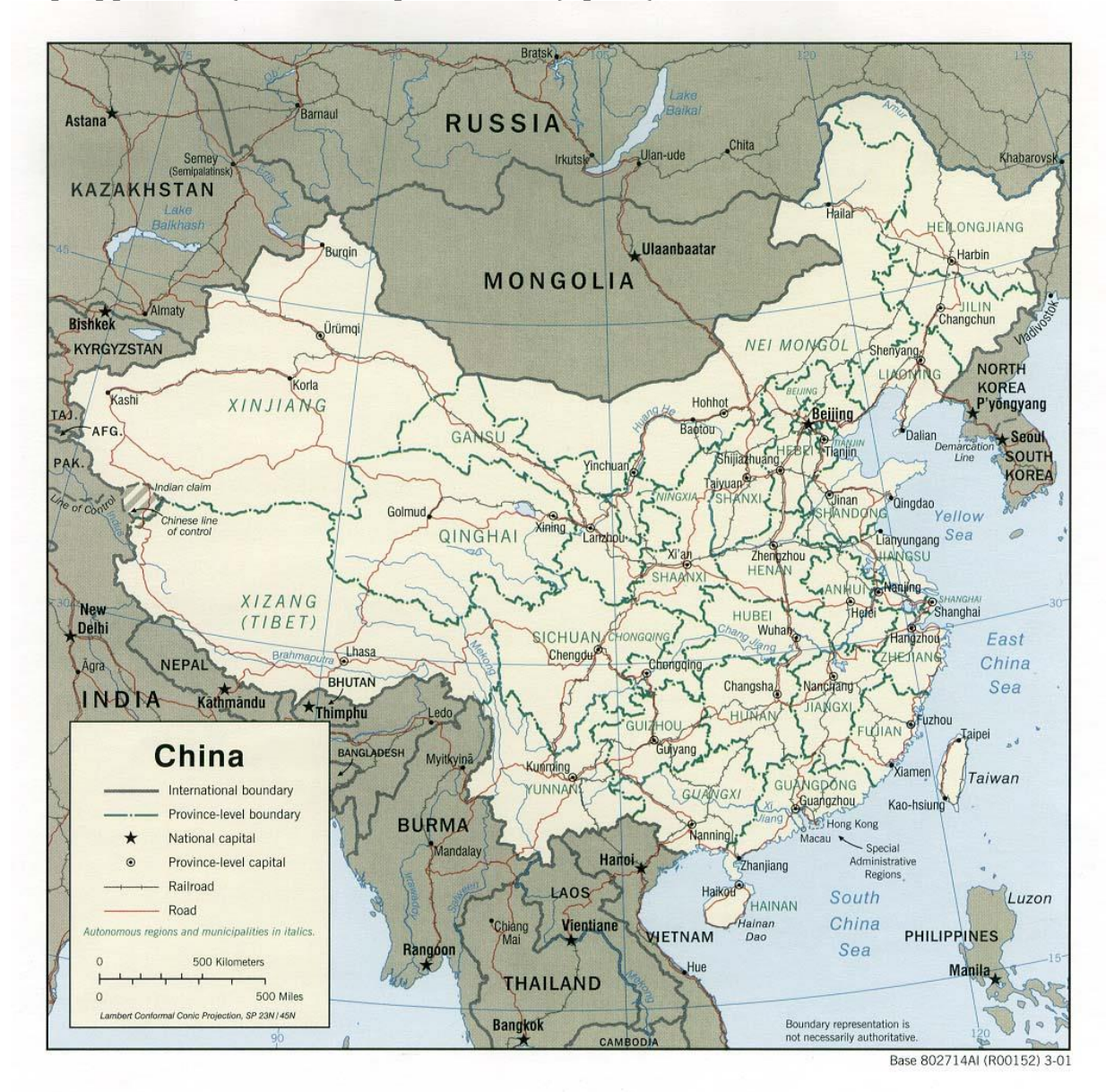
Maps: pp. 13-15, p16