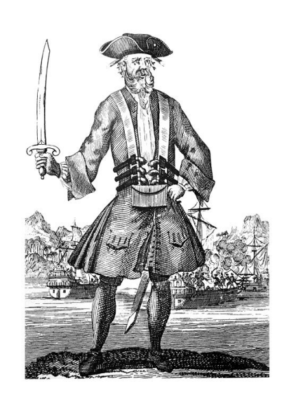
http://en.wikipedia.org/wiki/A General History of the Pyrates

At the conclusion of the unit of work hold a class party with pirates as the theme. Students can create their own costumes and brainstorm theme-related food to bring.