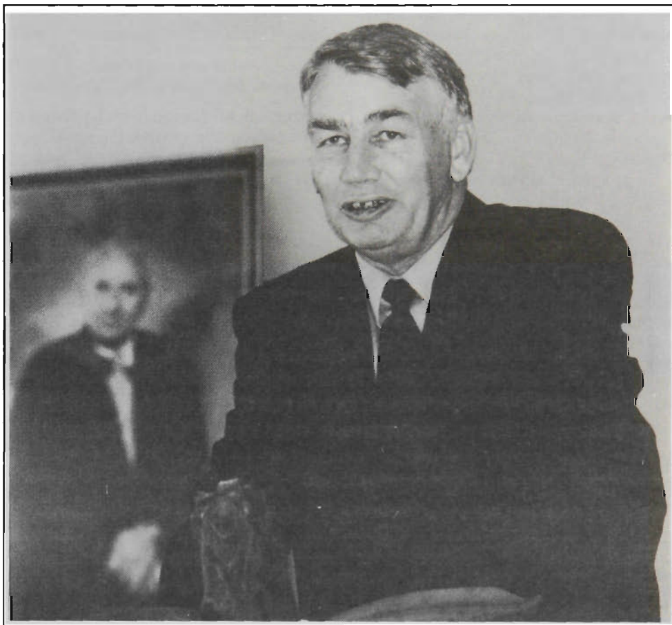
Mr Howe announcing the new health centre

One of the initial tasks of the centre will be to develop a multi-disciplinary, community-based approach to continuing education for those involved in primary health care.