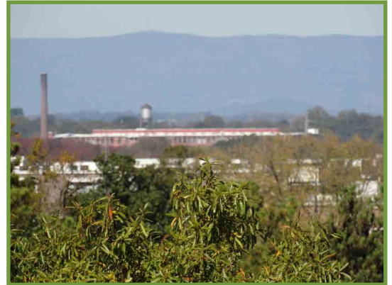
View Facing Northwest from 302 University Ridge