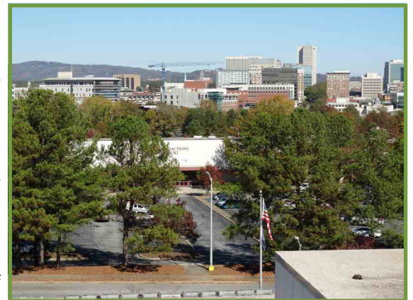
Northeastern View from 302 University Ridge

Church Street is a South Carolina Department of Transportation (SCDOT) owned road, and the main thoroughfare currently connecting to the University Ridge campus. The intersection has good current capacity, though there is some slowdown further into Downtown on Church Street during peak traffic. The City of Greenville owns Howe Street and Harris Street. The intersection of University/Howe/Harris is not safe and improvements may also be needed at Harris and Augusta Street depending on the development plan.