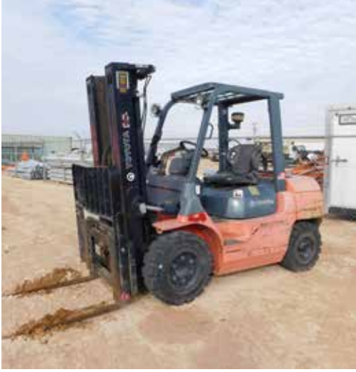
Toyota 7FGU35 8000# Forklift