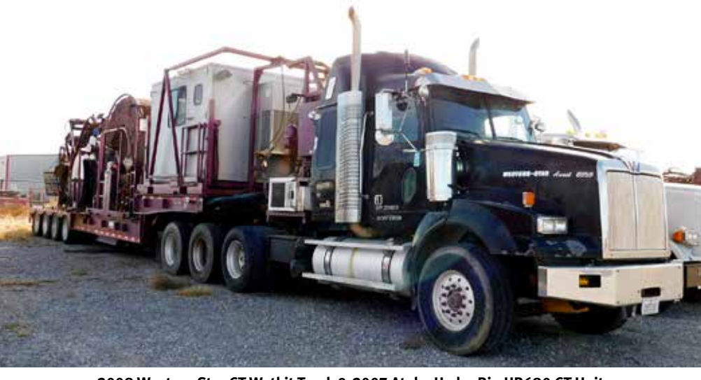
2008 Western Star CT Wetkit Truck & 2007 Atoka Hydra Rig HR680 CT Unit

Contact: Donald Bridge @ 580.821.4945 or 580.225.6922 | Jean Orgeron @ 337.288.9667 or 337.373.5400