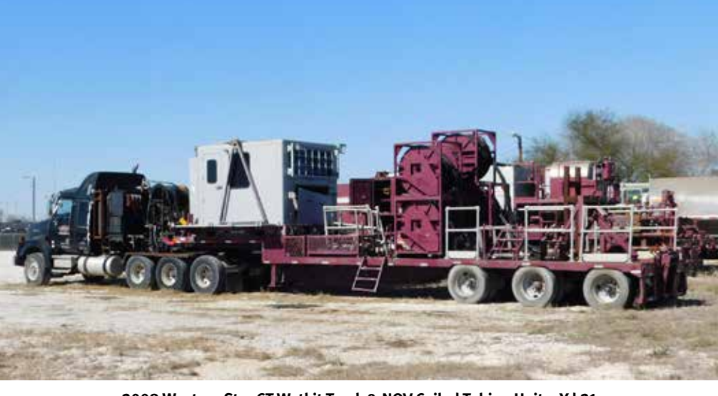
2008 Western Star CT Wetkit Truck & NOV Coiled Tubing Unit - Yd 21