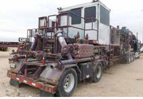
2007 NOV Rolligon 1000HP Quintuplex Double Pumper