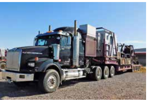
2008 Western Star CT Wetkit Truck & NOV Hydra Rig HR680 CT Unit – Yd 24