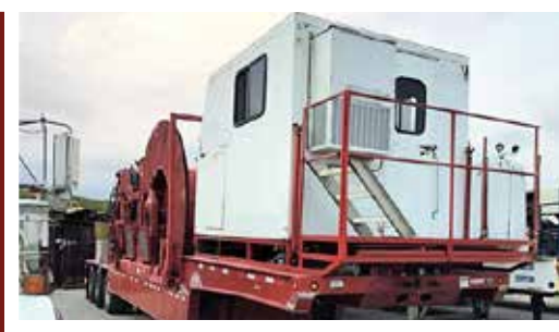
2009 NOV Hydra Rig 560 CT Unit

6501 SW 44th St., Oklahoma City, OK 73179 Preview Starts: Feb. 15th, M-F, 8-4 Checkout: Feb. 25th thru Mar. 12th; M-F, 8-4 Contact: Lance Cross @ 405.596.4998 Loadout Available up to 15,000#