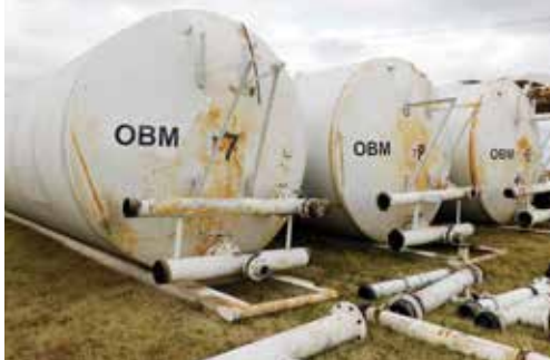
Dragon 500Bbl Frac Tanks