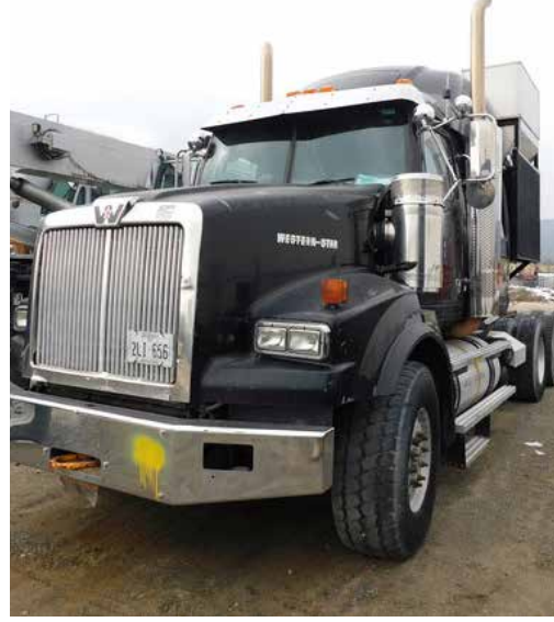
2008 Western Star 4900FA CT Wetkit Truck