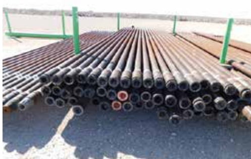
BN Drill Pipe - Yd 8