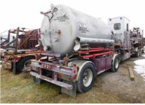
2007 NOV Hydra Rig Nitrogen Pumper - Yd 20