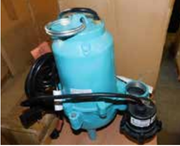
Little Giant Sump Pump - Yd 1