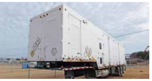
1 of 4 - 2012 Enerflow CAT9600 Chemical Vans

Preview Starts: Feb. 15th, M-F, 8-5 | Feb. 25th thru Mar. 12th; M-F, 8-4 Contact: Tamara Casteel @ 432.813.9690 | Loadout Available up to 15,000#