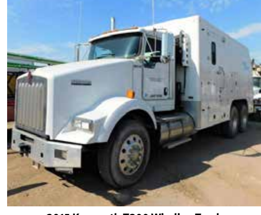
2015 Kenworth T800 Wireline Truck