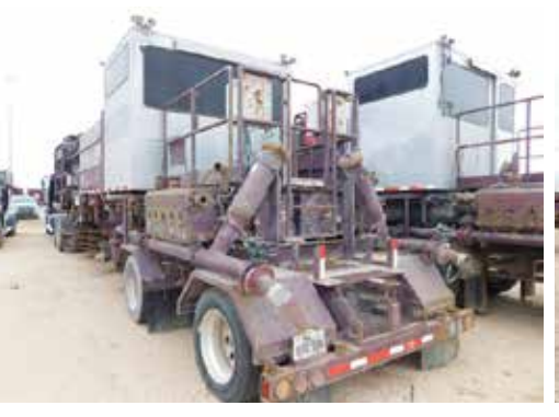
2007 NOV Rolligon 1000HP Quintuplex Double Pumper

Contact: : Chuck Roberts @ 432.557.4678 or 432.250.6213