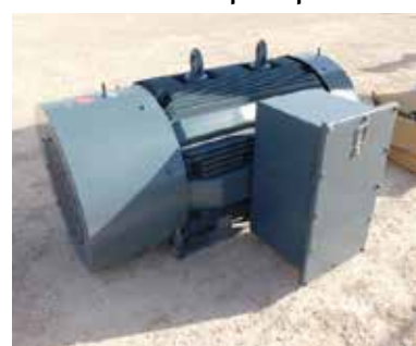
Toshiba 600HP Motor - Yd 6