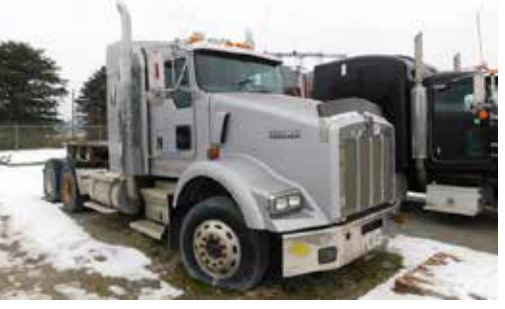
2002 Kenworth T800 Truck Tractor

4 Girton Drive, Muncy, PA 17756 Preview Starts: Feb. 15th; M-F, 8-4 | Checkout: Feb. 25th thru Mar. 12th; M-F, 8-4 Contact: EJ Foley @ 570.404.7876