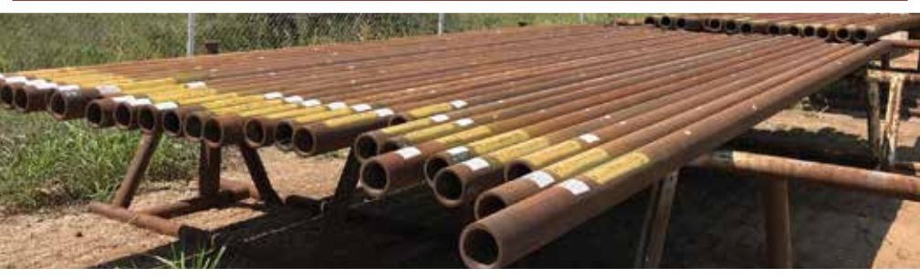
6.25" to 8" Slick Drill Collars