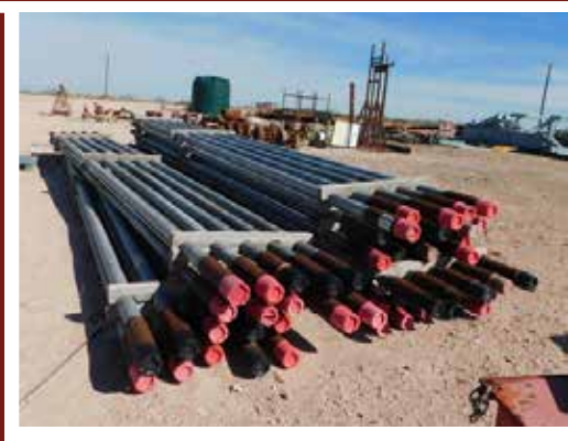
Aluminum Drill Pipe