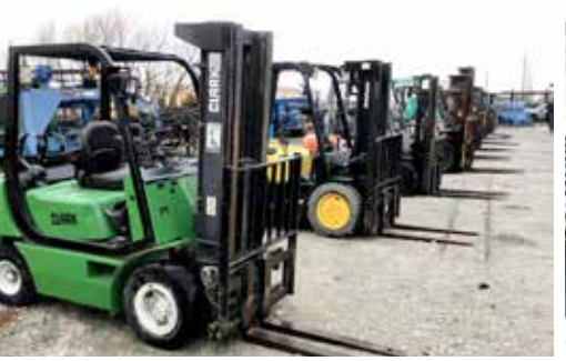
9 - Fork Lifts - Yd 25