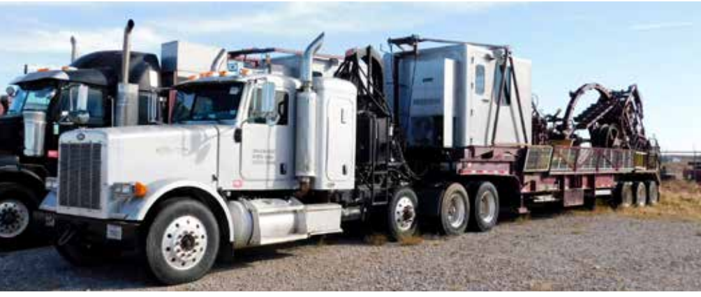
2006 Peterbilt 378 CT Wetkit Truck & NOV 580 CT Unit