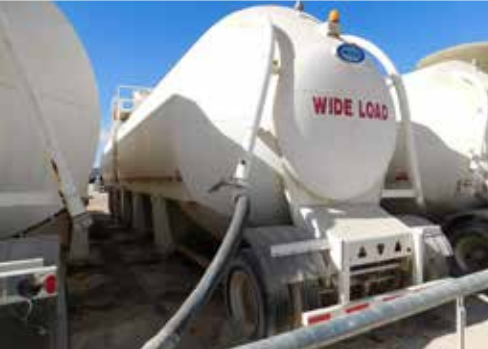
Dragon 500Bbl Frac Tank