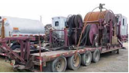
2007 NOV Hydra Rig CT Reel Trailer