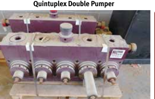
2016 Dragon 3.5 in Quintuplex Pump Fluid End