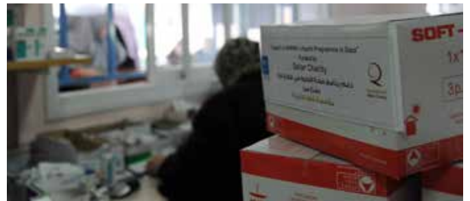
Vital medicine ready for distribution at a health centre in Gaza.

Gaza - Qatar Charity and UNRWA have signed an agreement to support the UNRWA Health programme in Gaza. Under this agreement, worth $1 million, UNRWA is procuring urgently needed medicines and physiotherapy equipment for Palestine refugees through UNRWA's network of health centers.