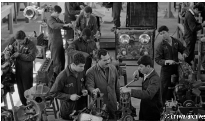
Students in the Auto Mechanics course at UNRWA's vocational training centre in Gaza Strip

In tandem with the digitized archive, UNRWA is also launching a website, where the 1,948 images will be available: http://archive.unrwa.org .