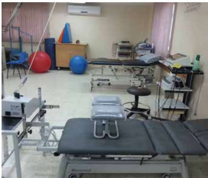
Medical Equipment in Tulkarem Health Centre