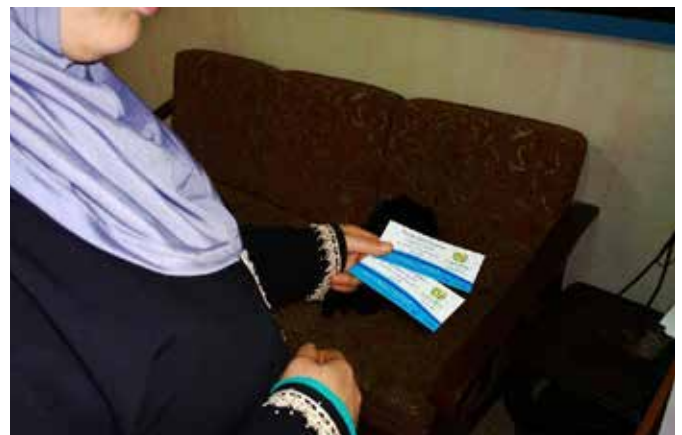
Palestinian Woman Receiving Vouchers to Fend Off the Winter Cold - December 2013

Human Appeal International (HAI) provided UNRWA with 254 vouchers to buy winter clothes from Daraghmeh Stores. The vouchers, worth $24 each, were distributed to Syrian and Palestinian children who, having fled the conflict in Syria, are currently attending UNRWA schools in Baqa'a and Marka camps, near Amman.