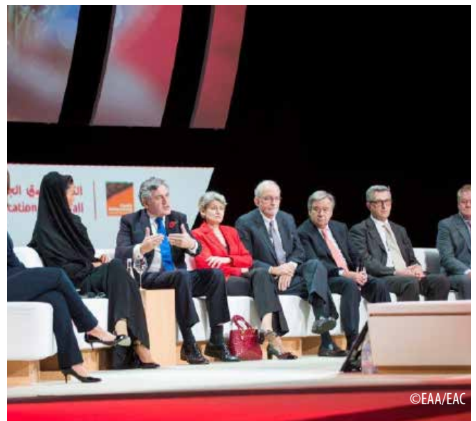
From the left, H.H. Sheikha Moza, Former British Prime Minister, Gordon Brown, Representatives of UNESCO, UNICEF, UNHCR and UNRWA,

WISE is now an ongoing initiative and a global reference in new approaches to education. Through both the annual Summit and a range of continuing programs WISE is promoting collaboration and building the future of education.