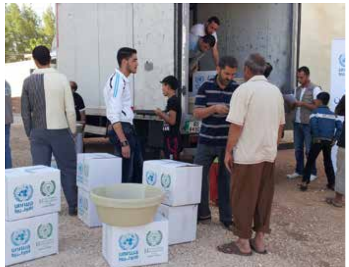
Distribution of Hygiene Kits donated by HAI In Cyber City, October 2013.

The number of Palestine refugees in Jordan from Syria has now reached 11,000, about half of them being children. As of 1 December 2013, a total of 1,810 students – 762 Palestinians from Syria and another 1,048 Syrians – were enrolled at UNRWA schools.