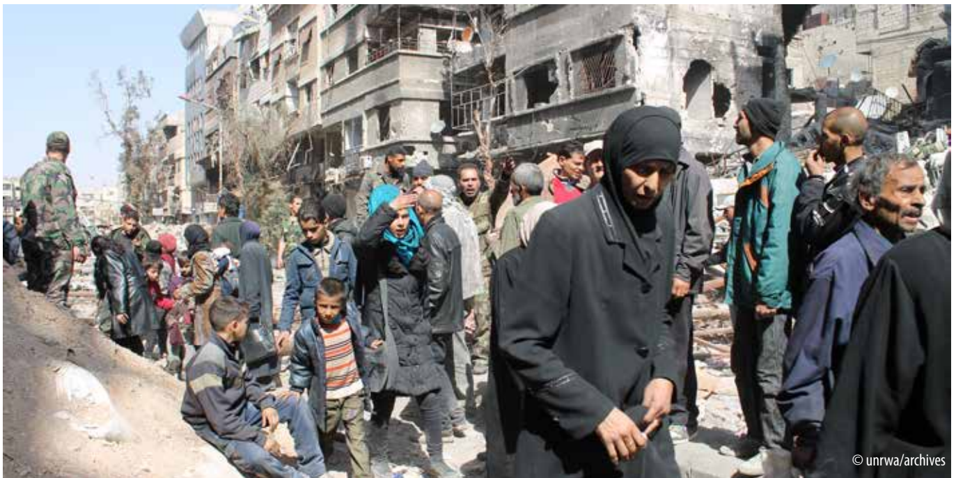
Gathered on Yarmouk Street, residents begin hurrying to reach the distribution point

Yarmouk has come to represent all places where - for Palestinians and especially refugees - control over one's life is an illusion, where the safety of decades can disappear overnight, where land is confiscated, homes are demolished, rights are denied, travel is restricted, jobs are lost, resentments and prejudices prevail. Yarmouk is Gaza, the open-air prison. Yarmouk is Nahr el-Bared, destroyed by bombs. Yarmouk is Jenin, it is Sabra and Shatila, it is Tel az-Zaatar. Yarmouk is the expulsion from Kuwait, it is 1967, all the way back to the Nakba. It was a beacon of resilience. Unless we act quickly, it risks becoming a symbol of dispossession, and of a history of repeated dispossessions.