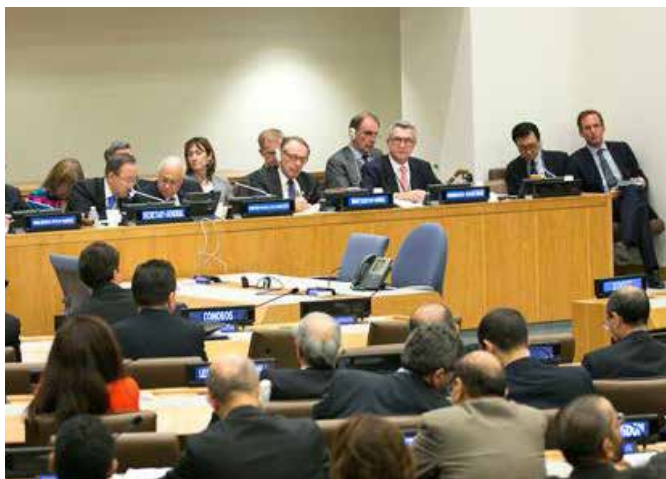
UNRWA Commissioner-General Filippo Grandi (right) during the New York Meeting Addresses Attendees

Ministers expressed particular concern about UNRWA's financial plight and emphasized the importance of maintaining a strong UNRWA as a contributor to stability in the region. In the conclusions of the meeting they reaffirmed their commitment to providing UNRWA with reliable long-term support. Arab donors reiterated an engagement to achieve and sustain the target of 7.8 per cent for Arab contributions to the budget supporting UNRWA's basic programmes, as set out in previous Arab League resolutions.