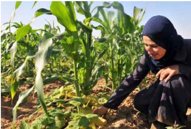
Beneficiary from the Job Creation Programme in Gaza