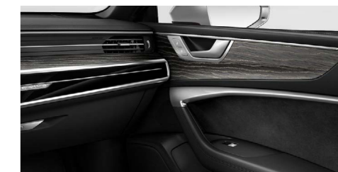
Inlays, fine grain ash, natural gray-brown