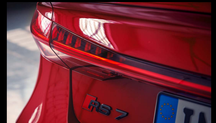
LED rear lights with dynamic indicators