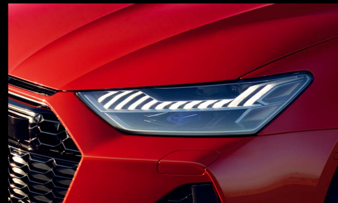
Audi laser light, the intelligent system combines LED and camera technology to improve safety and create a fabulous look

With its sporty roof line, the Audi RS 7 Sportback draws admiring looks whatever the surroundings. The striking design never fails to impress right down the line. The characteristic RS wide body with broad flared wheel arches front and rear, the continuous LED light strip and the wide Audi frameless Singleframe are the visible expression of outstanding performance.