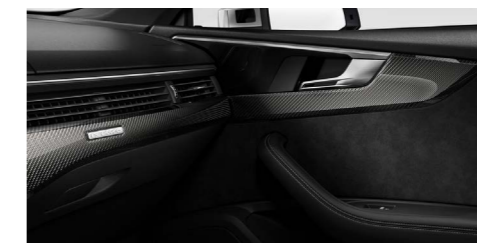
Inlays in carbon twill