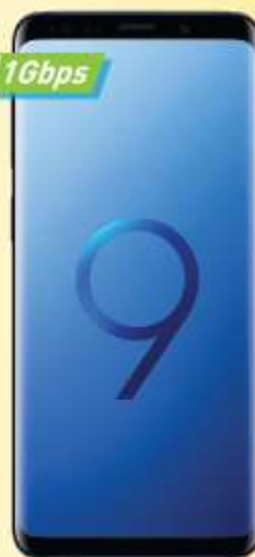
Samsung Galaxy S9

Plus, FREE unlimited weekend data on Singapore's first 1Gbps network*.