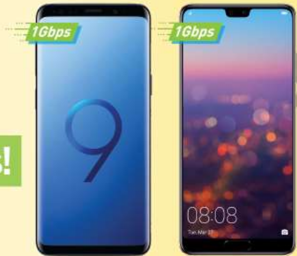
Samsung Galaxy S9

Plus, FREE unlimited weekend data on Singapore's first 1Gbps network*.