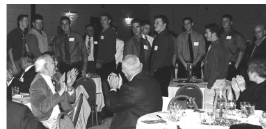
Members of the state champion Notre Dame-Cathedral Latin School baseball team stand to receive a rousing round ovation from the Latin alumni at the Hall of Fame dinner.