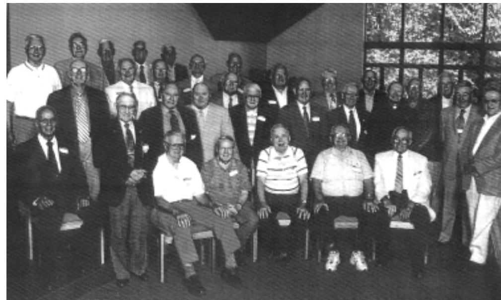
Attendance was strong for the 60-year reunion of the Latin class of 1941, held in Chagrin Falls.

To date, 65 memorial donations totalling $3,600 in have been made to Cathedral Latin Alumni Association.