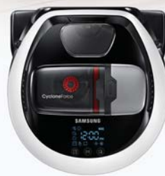
POWERbot™ VR10M7020UW/SP 10W Turbo Suction Power Robot Vacuum Cleaner