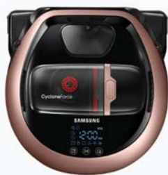
POWERbot™ VR20R7250WD/SP 20W Turbo Suction Power Robot Vacuum Cleaner