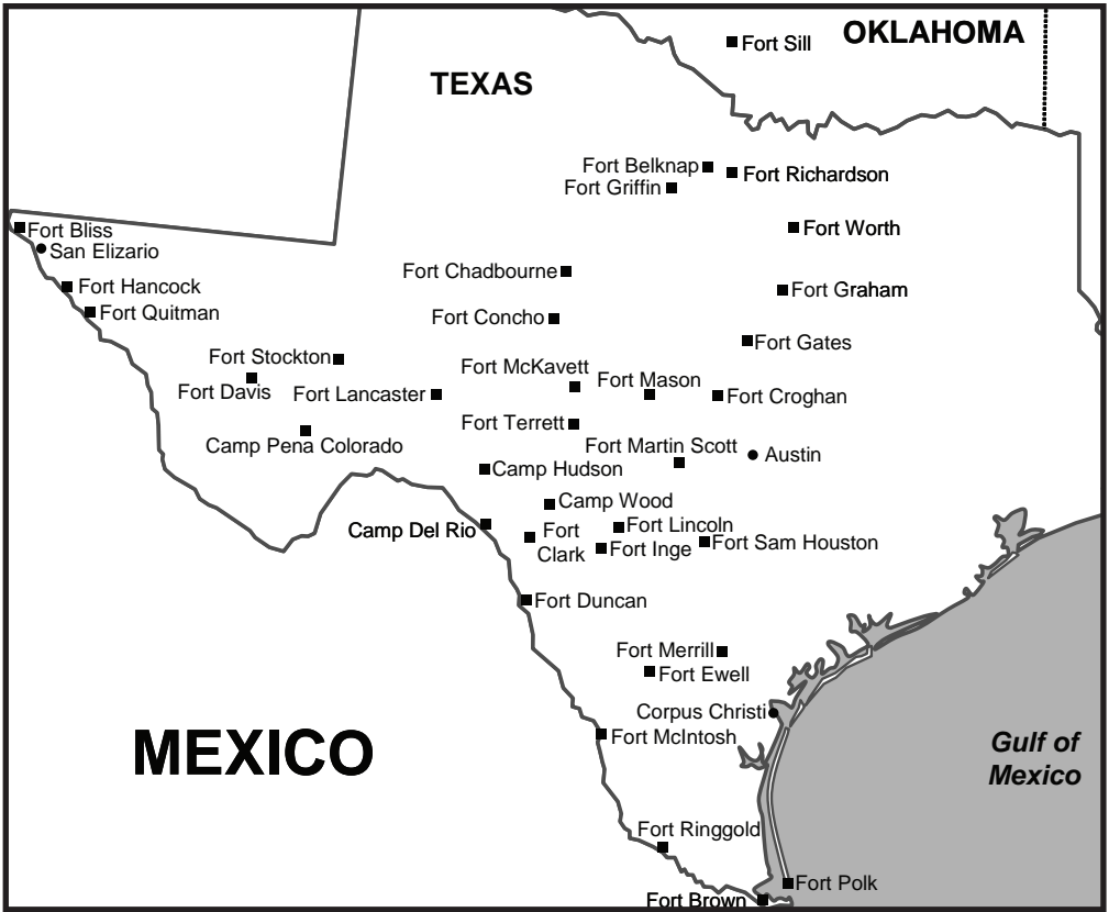
Map 4. Forts in Texas.

subpost, and a detachment of two to fifteen men held a picket station in most cases.