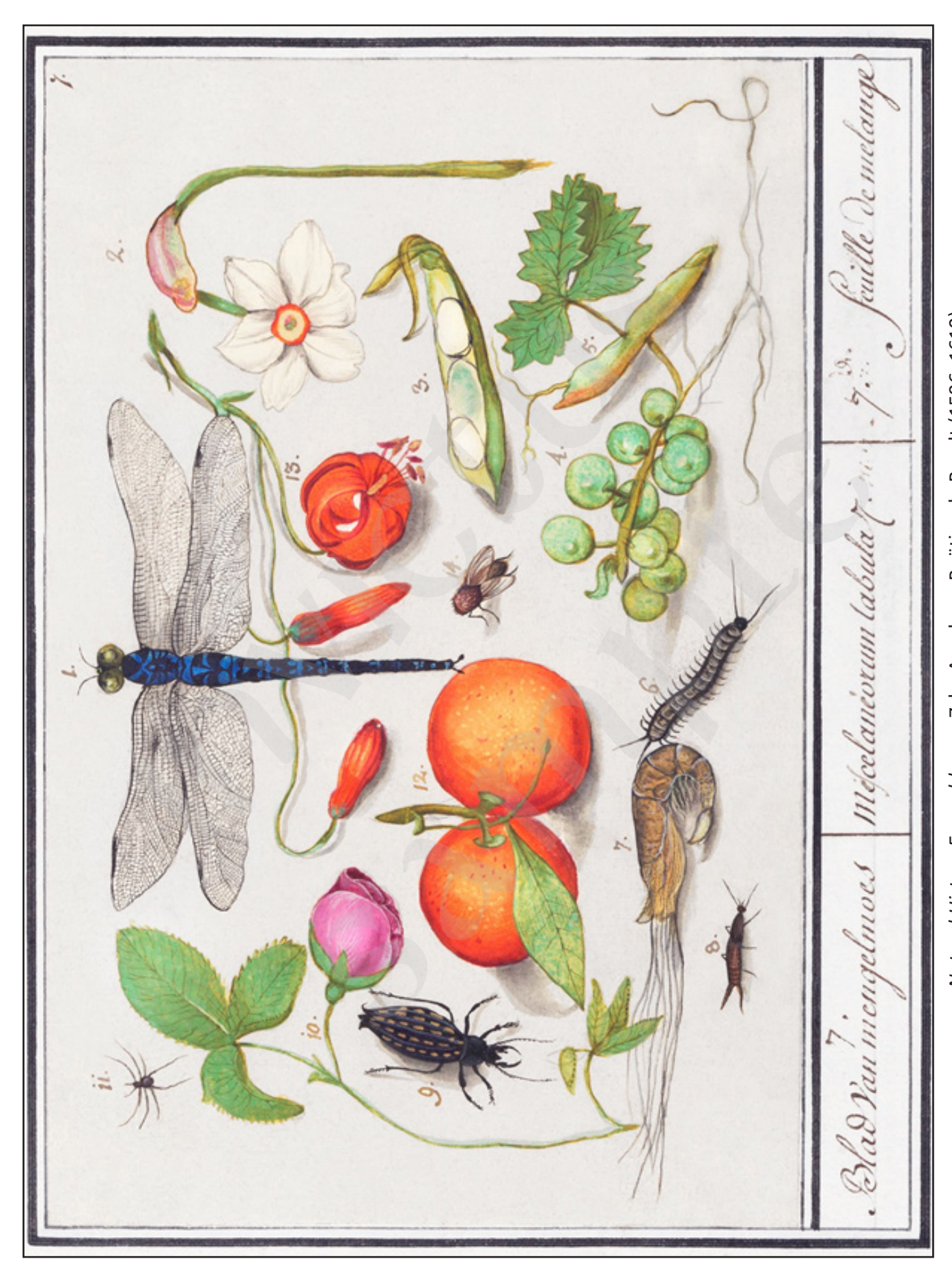
Natural History Ensemble, no. 7, by Anselmus Boëtius de Boodt (1596–1610)