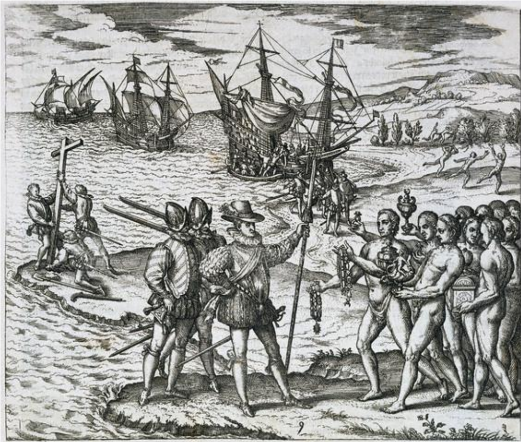
[Engraving of Columbus meeting natives.]