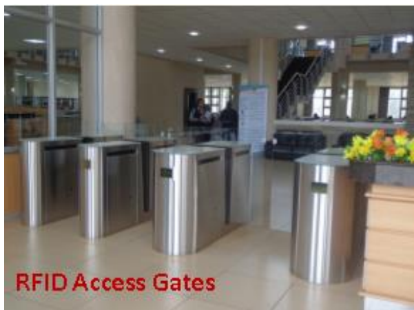
RFID Access Gates

The exits of RFID-enabled library is equipped with a RFID security gates look like standard securities in libraries but in this case have the capacity to emit sound alarms if the material has not been checked out (Palmer, 2006; Mehrjerdi, 2011).