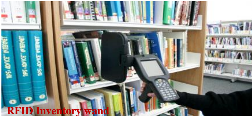
RFID Inventory wand

One key enhancement to RFID Technology at CUEA library is the implementation of an e-payment system which is an online payment with virtual accounts that can be topped up through mobile money services (M-Pesa, Airtel Money) Accounts (Visa, MasterCard, etc.). This e-payment system integrates with RFID-based operational components such as multifunctional printers, point of sale (POS) systems to facilitate cashless payment of library fines, and seamless academic support services such as self-service self-printing, photocopying, payments in cafeteria, bookshop, infirmary and college fees payments.