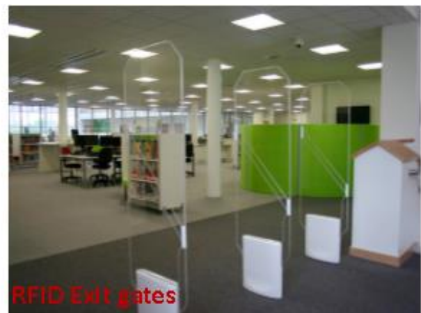
RFID Exit gates

Another component is the inventory wand which is a hand-operated used to scan library material on the shelves for the purposes inventory management, weeding, and finding misplaced materials. The inventory wand consists of scanners for use with RFID tags placed on materials and a PDA for processing. Most inventory wands can be connected to the library management system (LMS) via wireless or wired connection to process reconciliation lists in the case of missing or misplaced materials (Howard & Anderson, 2007; Seadle & Yu, 2008).