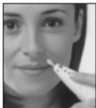
UPPER LIP AND FACE