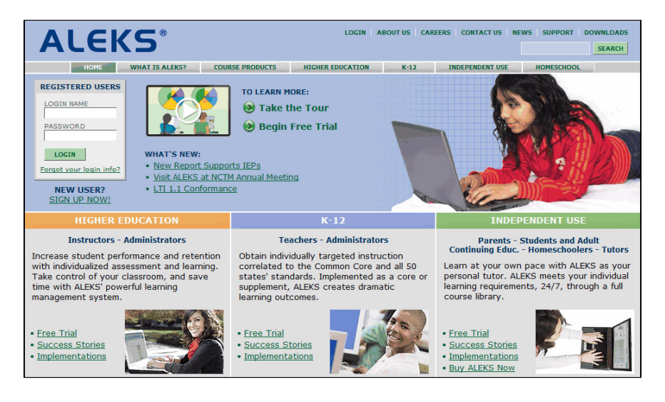
Figure 1: The ALEKS Website [website]