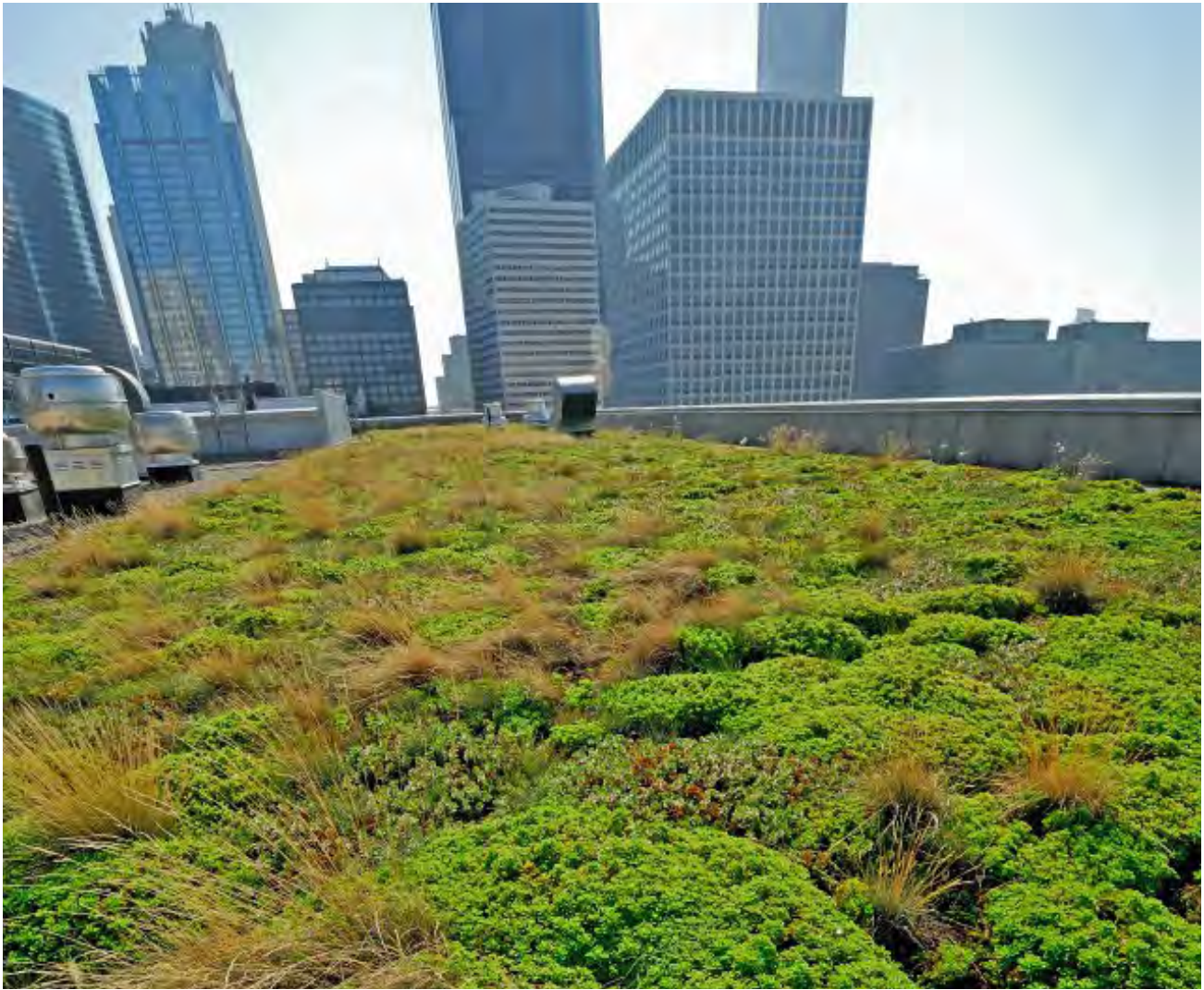
A green roof tops the Chicago building where USG's corporate headquarters are located.

Water is another natural resource that USG is committed to using responsibly. Both wallboard and ceiling tile manufacturing use water and emit excess water vapor from our emission stacks.