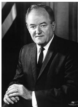
Hubert H. Humphrey U.S. Vice President 1965 - 1969